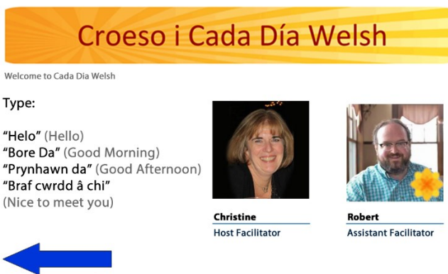
Figure 2. Cada Dia Welsh template slide, illustrating the use of helper text during the web meetings, and question prompts for meeting participants.