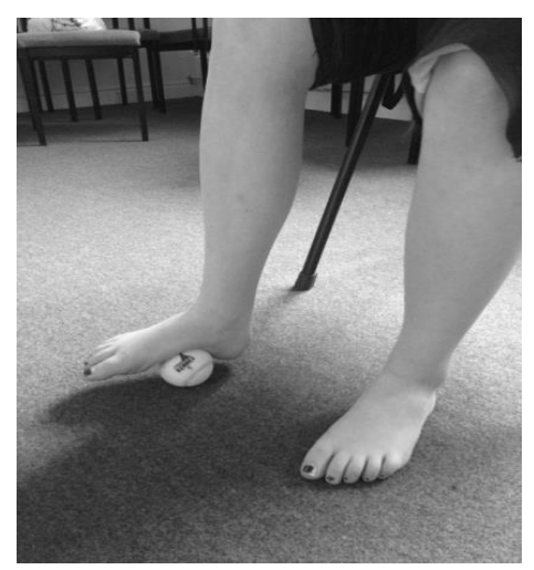
Figure 3: Position of the tennis ball on the plantar aspect of the foot during SMR