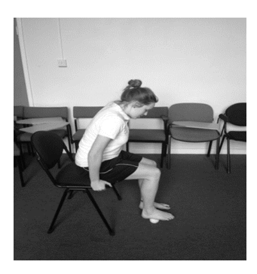
Figure 4: SMR intervention seated

Figure 3: Position of the tennis ball on the plantar aspect of the foot during SMR