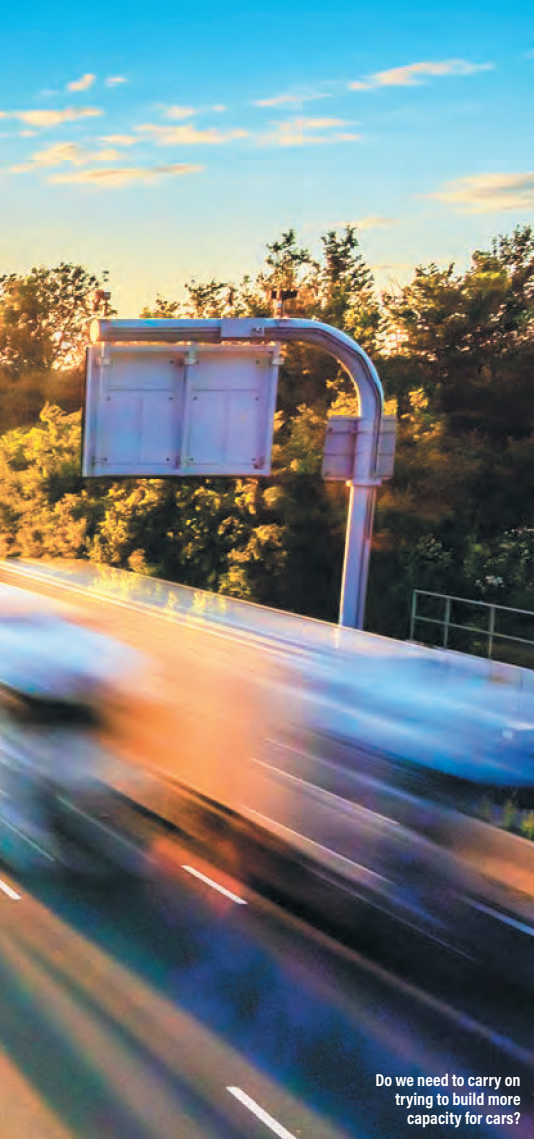
Do we need to carry on trying to build more capacity for cars?

mobility system. I must say I have been amazed by some colleagues who seem to be optimistically holding on to the idea that the old armoury of transport planning analysis and appraisal is still what we need to press on with and that the Covid-19 shock will be over relatively soon. Time will tell.