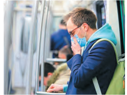
^ The current social distancing effects on public transport could be long lived

In terms of scale of the challenge and where we are going to go to next, what the new normal might look like and how those scenarios play out, the level of uncertainty is massive. Scenario planning it seems will be very much needed. There could be a behavioural rebound effect beyond the lockdown, yet people may have become accustomed to the relative safety of digital for some of their activities, such as shopping.