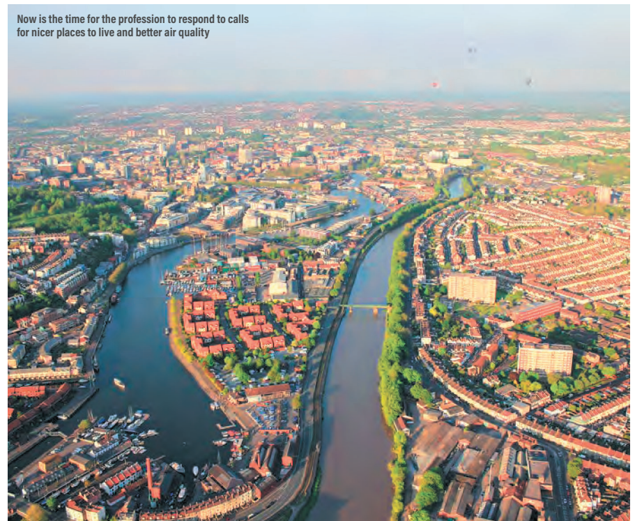
Now is the time for the profession to respond to calls for nicer places to live and better air quality

With big infrastructure schemes she called for us not to stick rigidly to the original plans. She said: 'Let's revisit those plans and embrace a collaborative approach to drawing in best practice in proving the inclusive nature of the designs concerned.' →