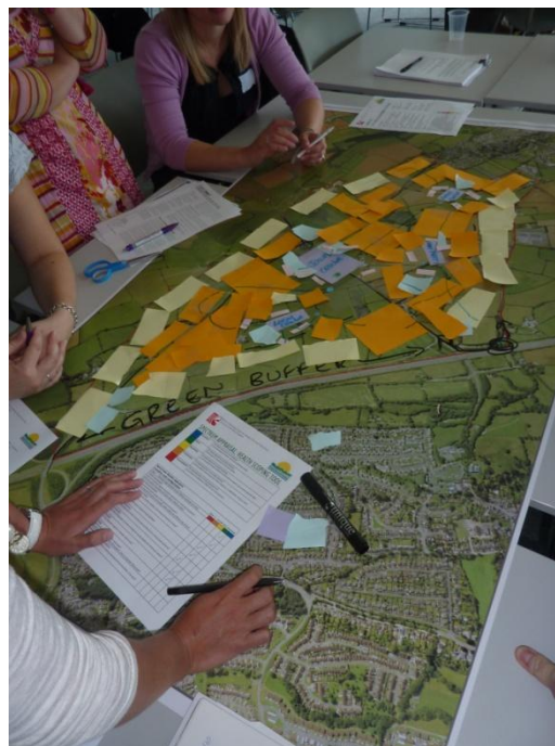
Figure 3: Participants getting to grips with designing a healthy settlement.

The next stage, a workshop attended by 43 participants during summer 2010, was based on the deconstruction of a celebrated good example, the Sherford Valley HIA (Cave et al, 2007). Using large aerial photos of the site, participants first got to grips with the spatial determinants of health through having to prepare a schematic design for a new development and then having to carry out a rapid health impact scoping of another group's efforts (Figure 3). This was followed by learning to use a critical appraisal tool (Winge Fredsgaard, Cave and Bond, 2009) to identify strengths and weaknesses in the published health impact assessment of Sherford Valley. Supported by the authors of the assessment and the local planning officer, valuable insights were obtained and lessons learned.