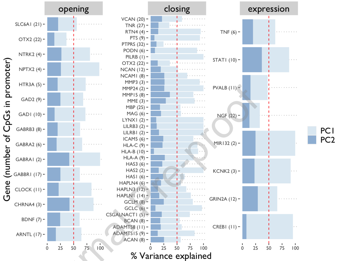
Figure 2. Variances of CpGs located in promoters of three sets of sensitive period genes, as explained by the first two principal components (PCs). The number of CpGs annotated to the promoter of each gene is noted in parentheses. The red dashed line indicates 50% of the variance. For 53 of 58 genes, variance explained by the first two PCs exceeded 50