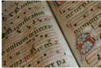
Berkeley family Antiphonary, 1457, Berkeley Castle

Piccolo, Flute Oboe, Cor Anglais Clarinet in Bb, Clarinet/Basset Horn (alternative Eb Alto or Bass Clarinet) 2 Horns in F 2 Bassoons (+ optional Contra Bassoon) Piano