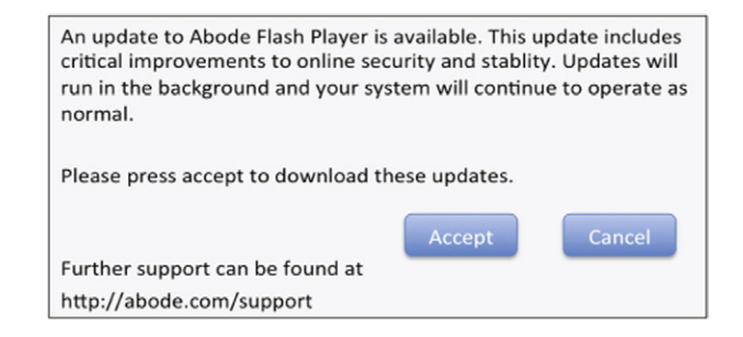
Fig. 2. Example mimicked authority update.

This message was presented to make participants aware that although their computer system was protected it was still vulnerable to attack via fraudulent communications or malware attempting to infiltrate the system. It was expected that whilst participants would read this message, they would likely differ in the extent that the information was processed. Following the computer task participants were tested