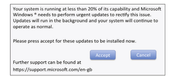
Fig. 1. Example genuine authority update.

Of the nine interruption trials, three update messages were designed as genuine authority update messages (Fig. 1), three as mimicked authority update messages (Fig. 2) and three as low authority update messages (Fig. 3). Genuine authority messages were designed to contain specific details linked to recognised expertise, organisations and software manufacturers (e.g., accurate programme reference, presence of a copyright symbol and genuine website link). Mimicked authority messages were designed to contain the same level of detail but provided an inaccurate reference (spelling error), an inaccurate website link and lacked a copyright symbol. These messages were designed to mimic the communications of legitimate software or organisations, as commonly found in the techniques of scams that mimic trusted institutions or