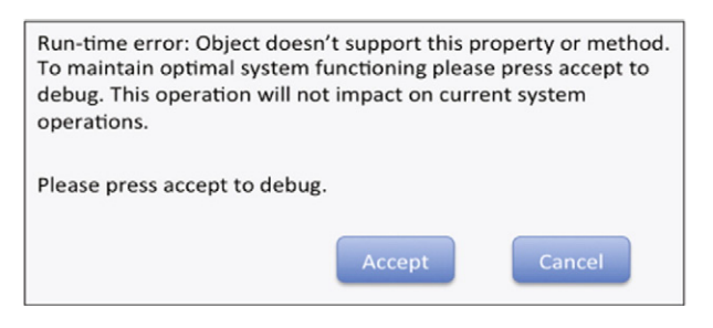
Fig. 3. Example low authority update.

on: (1) whether they remembered reading the message; (2) message content; and (3) whether they felt that they took the message seriously. Following this, they were also asked to judge the degree to which they abided by the message content, i.e., 0% of the time to 100% of the time. In total, Phase 1 took approximately 15–20 min to complete.