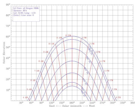
Figure 2: Elevation of the sun above the horizon. Chart generated from http://solardat.uoregon.edu/SunChartProgram.html

The amount of sunlight available and the angle are dependent on the geographic location of the solar panels. So to calculate this, we must first gather historical data of solar elevation for the latitude and longitude of EMMA – 52.829290, -1.331927. This can be shown in Figure 2 which plots solar elevation throughout the months between the Summer and Winter solstices of 2016.