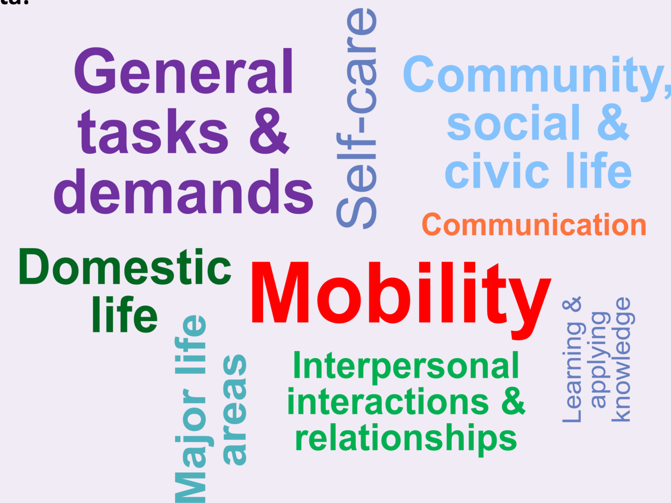
Figure 1: ICF Activity and Participation domains represented in the data:

Responses were received from 347 participants (80% female, 91% non-recovered, 53% disease duration ≥ 3 years).