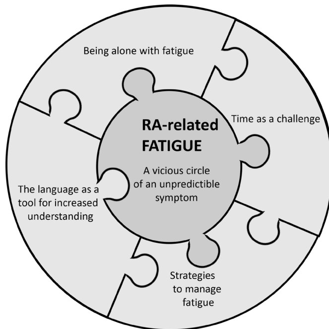
Figure 3 The interrelated findings of the experience of rheumatoid arthritis (RA)-related fatigue.

Based on the systematic interpretive analysis, we identified an overall theme 'A vicious circle of an unpredictable symptom' and four subthemes, interlinked to each other and to the overall theme: 'being alone with fatigue'; 'time as a challenge'; 'language as a tool for increased understanding' and 'strategies to manage fatigue' (figure 3).