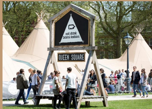
Site of the Sustainable Food Summit, Queen's Square