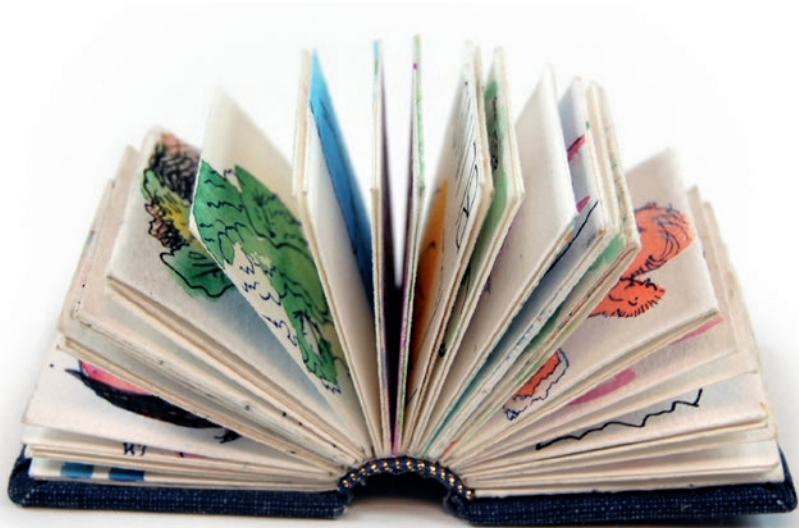
One of the filled-in sketchbooks sent by artists at Stephen F. Austin State University (SFA), Texas, USA.