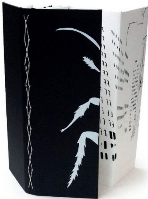
Metamorphosis , Charlotte Hall, MA Printmaking alumna. Edition of 15, 2013. Screenprint on Somerset Satin, 315 x 103mm. Two double-sided concertinas stitched into a hardback cover using the snowshoe stitch.