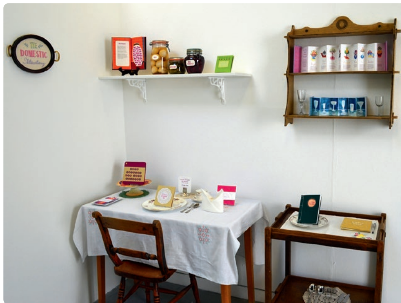
The Domestic Miscellany, artist's book installation by Corinne Welch, 2014.

We have also been actively involved since 2008, in the 'Al-Mutanabbi Street Starts Here'