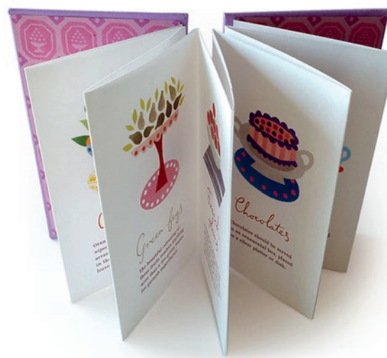
Dessert Displays, Corinne Welch, 2014. Clothbound concertina book of collage illustrations and hand-drawn typography, 2014.