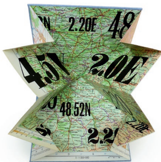
Paris, France, Hazel Grainger, 2012, for 'Regards Croisés: France-UK'. A hardcover book that opens like a clamshell or compact to reveal a folded atlas page representing an area of France. Overprinted in letterpress with numbers and letters indicating the coordinates of Paris according to the index of the atlas.