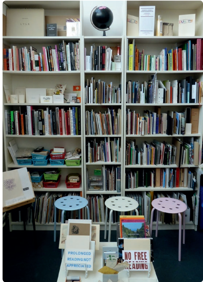
The Centre for Fine Print Research collection of artists' books out for handling.