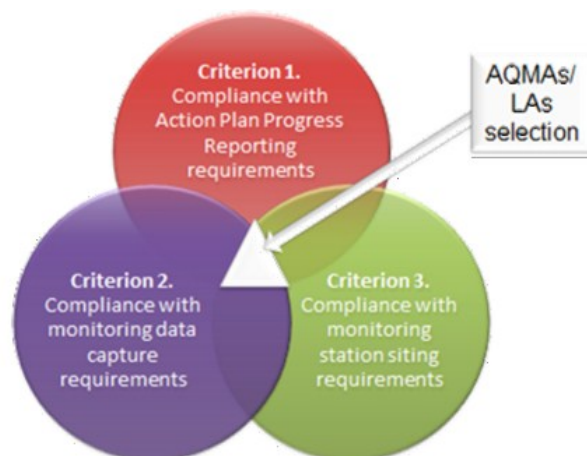
Figure 2: Criteria used to identify local authorities/AQMAs used in this study

This paper describes the methodology relating to all six case studies, and presents the results of the AQAP analysis in the Bristol AQMA as an example.