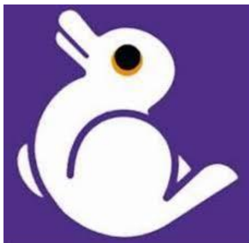
Figure1: The duck-rabbit: your point of view affects what you ,see‘.

and that observations are theory laden. As an illustration of this, see Figure 1, is it a duck or is it a rabbit? The conclusion comes from the theory (or more precisely in this case, perhaps the angle of the observer's head) brought to the observation by the observer.