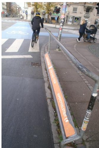
Figure 3: Equipment specifically for cycle traffic: footrests in Copenhagen