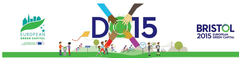
Figure 4: Do 15

( https://www.bristol2015.co.uk/about/ ). Here again the metaphor of utopianism is in seeking a better future. This slogan notably omits ‘green’ and/or ‘carbon’. So saying, it is still green in colour.