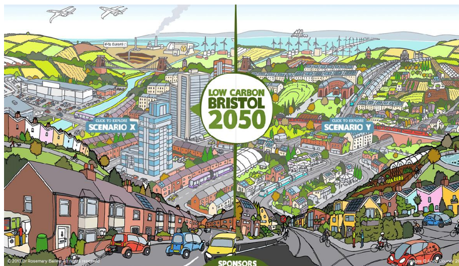
Figure 2: Low carbon Bristol image from X to Y

As reflected in referencing ‘green’, environmental issues underpin the Green Capital narrative – particularly climate change. Those promoting it speak of the city preparing for an ‘opportunity to take the next step’ ( http://www.bristol2015.co.uk ), hence a process of future change.