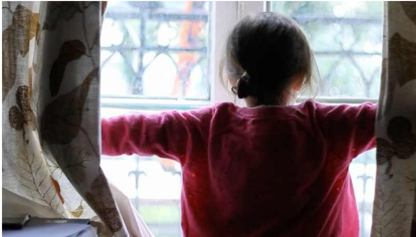
Figure 5: Little girl waking and opening the curtain to a new day Candice Pepperall - Green Blue

future what he say saw was 'As dawn brought tomorrow I woke to today'. ( https://www.youtube.com/watch?v=5LPYQxhZg&feature=youtu ).