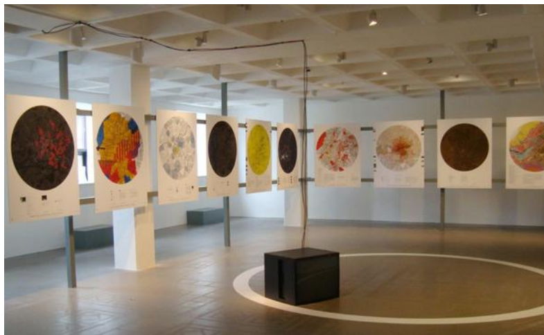
Figure 6: Photo Stuart Whipps

The city as depicted on a canvas - Doing Things Separately Together, 2014