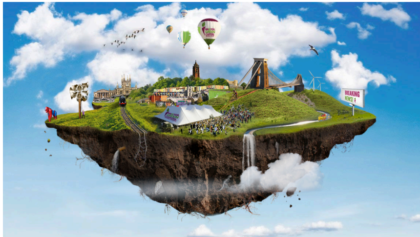
Figure 1: Utopian view of Bristol from Green Capital website

To first describe Figure 1; it shows the Clifton Suspension bridge, the University of Bristol, Clifton cathedral, balloons representing the balloon festival based in Clifton and on the edge, the gorilla sculpture from Bristol zoo, again based in Clifton. Thus, imagery in this view is primarily depicting the Clifton village and would be particularly familiar to those living and/or working in this area. However, Clifton is but one part of the city. More to our point, Clifton village is one of the most affluent areas in the city. What we highlight is that Bristol, specifically Clifton, is no longer embedded but uprooted from the wider city; the imagery illustrates the root systems with stones falling away.