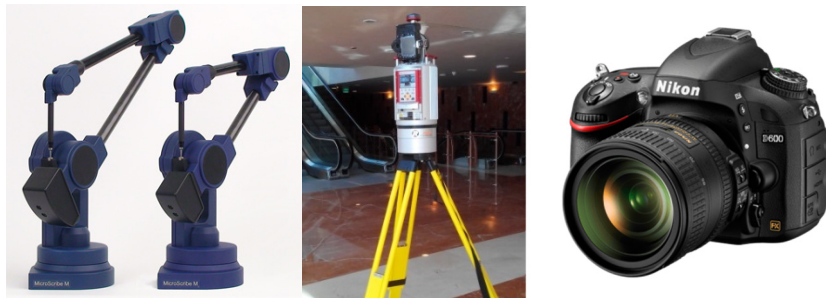
Figure 2: 3D scanning/photogrammetry devices. Left: A contact-based MicroScribe MX device (photo taken from [4]). Center: The Riegl VZ-400 terrestrial laser scanner. Right: The Nikon D600 digital camera shipped with Riegl VZ-400 scanner.

also widen the capture range as no physical contact is required. Lidar or laser scanning technique is the most relevant in our context. The principle consists in emitting laser beams, of frequencies typically between 500–1500 nm [5], and analysing the reflected beams, in order to measure the distance between the device (cf. Figure 2 center) and the scanned objects. Laser scanners are widely used as we will see next. One of the main reasons of their wide adoption is that a laser beam has a tight focus, meaning that it can be used to capture large scenes, contrary to other optical techniques which lose focus for large distances.