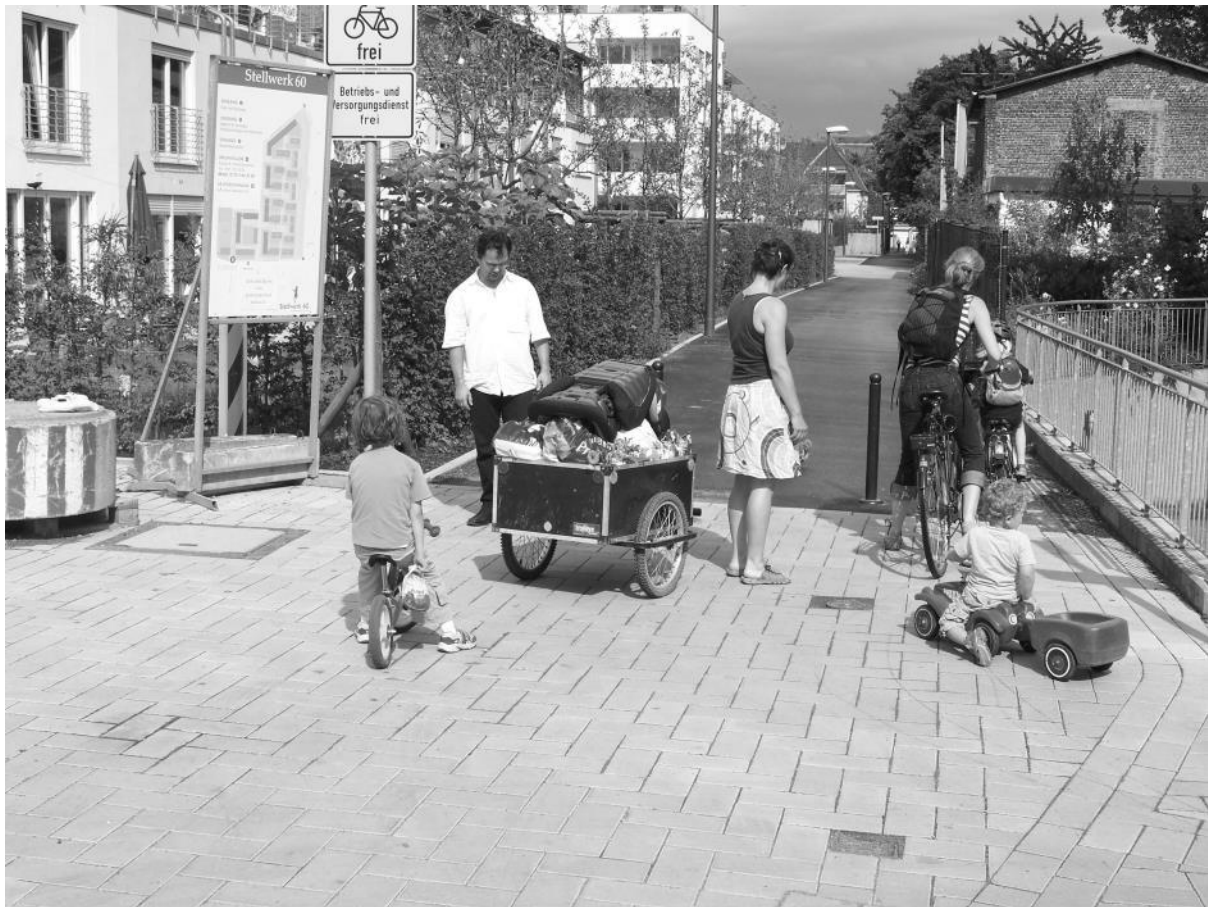
Figure 3 Access to Stellwerk 60, Cologne

as removal vans and emergency vehicles, but not for general deliveries which are done by hand, sometimes using trolleys or cycle trailers (Figure 3).