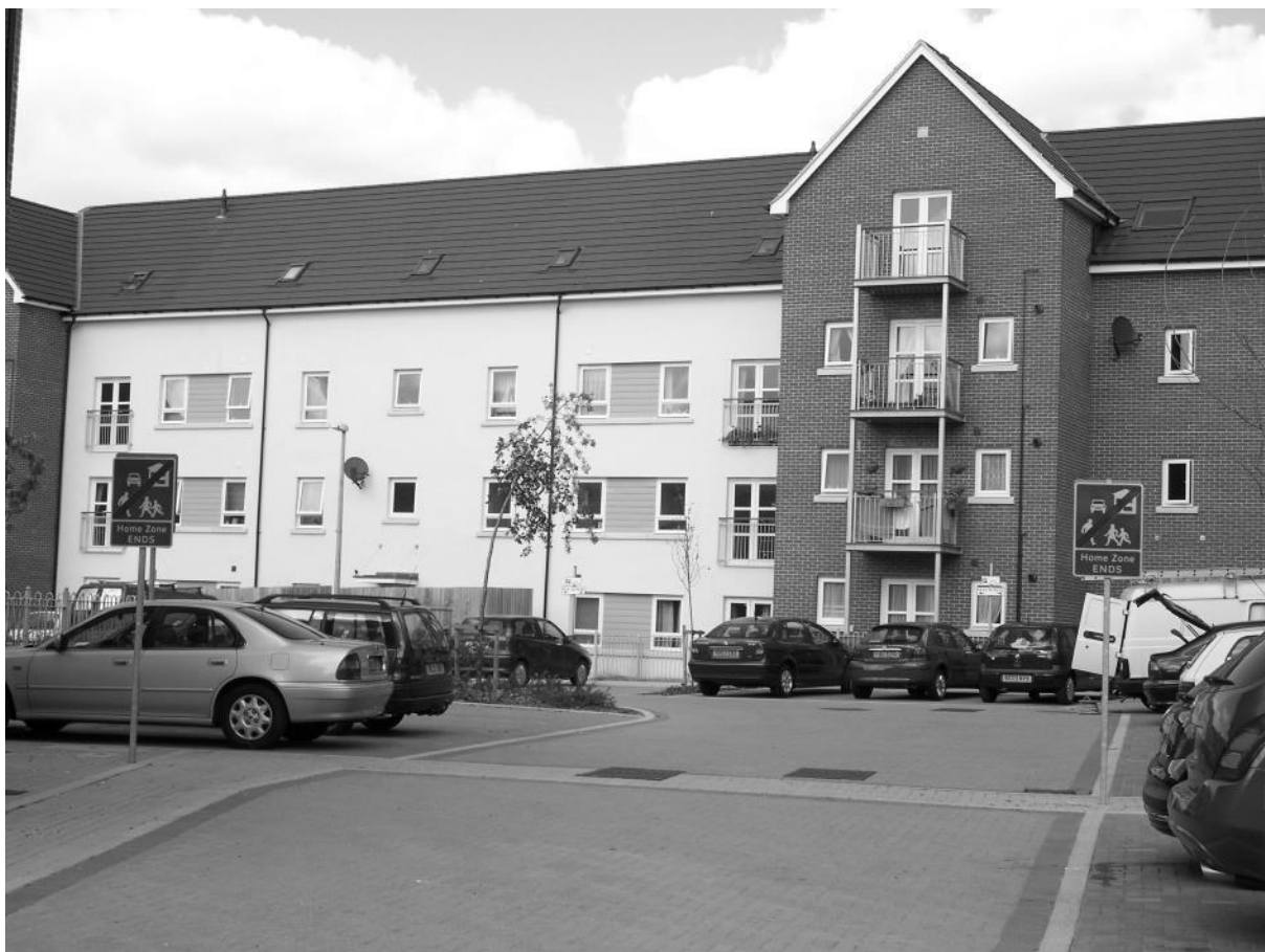
Figure 5 Poole Quarter