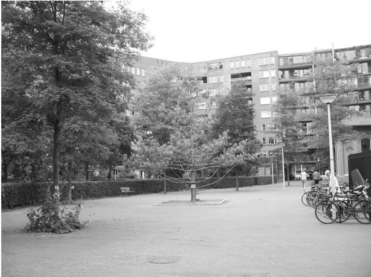
Figure 4 GWL Terrein, Amsterdam