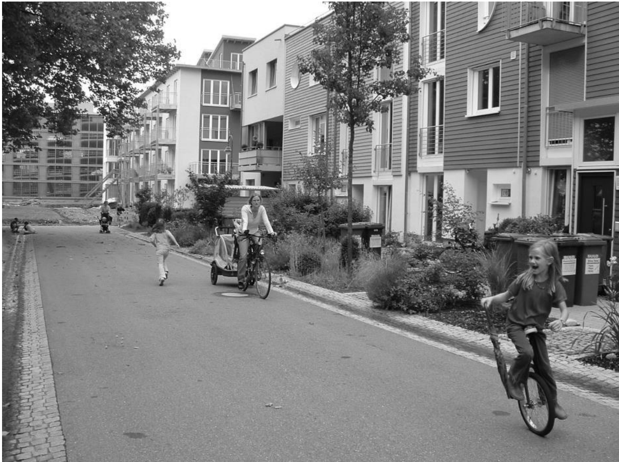
Figure 2 Stellplatzfrei street, Vauban, Freiburg, Germany

Although vehicles are physically able to drive down the residential streets, and the no-parking rules are not effectively enforced, in practice, vehicles are rarely seen moving on the stellplatzfrei streets. Signs emphasise that children are allowed to play everywhere, and in the absence of moving traffic, children are more evident (Figure 2) than in the more conventional home zones and traffic-calmed streets common elsewhere in Freiburg.