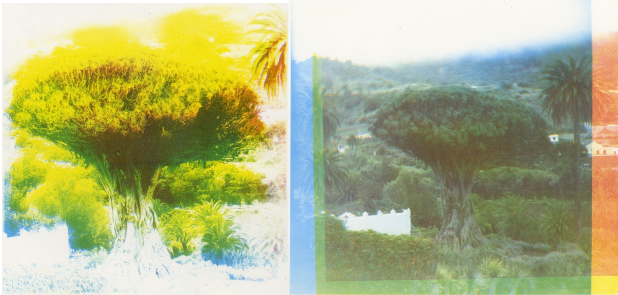
Figure 9:: Dragon Tree in Icod de los vinos, left side lithograph without screen, right side lithograph with 133 lpi screen. Both prints 20 cm x 20 cm.

On the left-hand side of Figure 9 the film used was Kodak Tri-X 400, on the right Arista EDU Ultra 100. Both films were developed with Rodinal 1+25. The Kodak Tri-X 400 was grainy enough to make the plate without a screen. The grain was much finer than in Figure 8 which has the same result as in Figure 7: the contrast was hardened. Even though the rgb negatives have the same density, the high colour temperature of the light at the time of recording, leads to more detail on the negative recorded through the blue filter and therefore to a yellow shift in the print. On the right-hand side of Figure 9 the negatives were recorded on a fine grained 100 ASA Fomapan film and we used a 133 lpi Kodak contact screen. The result is a much more realistic colour reproduction. Since we are not after a truthful colour reproduction, we can achieve that or come close to it with the digital cameras in our mobile phones, halftone is a welcome tool to change colour and contrast in the prints and achieve surprising results.