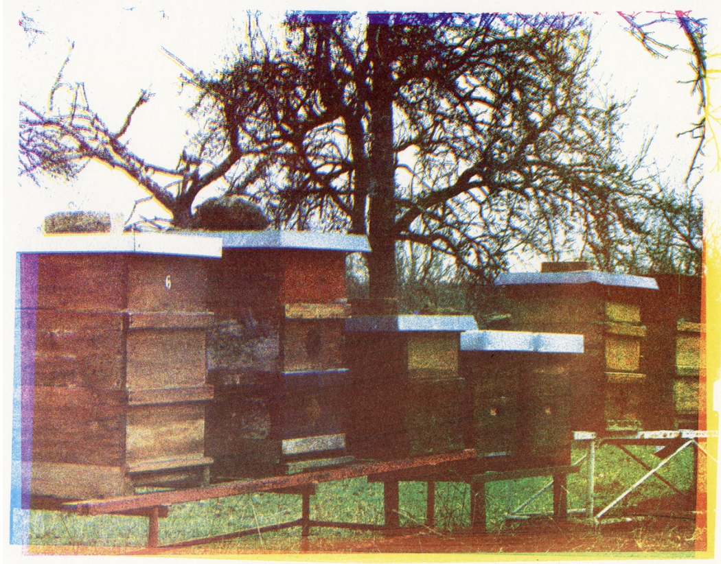
Figure 8: Heimat 1, full colour lithograph, no screen

Figure 8 is an example of a full colour lithograph without screen. The halftone is the result of the grain of the film. The image was recorded in winter on Ilford Delta 3200, recorded through red, green and blue filters. The exposure was measured with a Gossen Profisix light meter through the filters. The film was developed with Rodinal 1+25. Because of the low lighting levels, the developed film became very grainy, grainy enough to make lithographic plates without any additional screen. The negatives were simply enlarged onto Arista Ortho Litho 3.0, brought into contact with the litho plate and exposed to UV light. The positive recorded through the blue filter was printed as the first with Van Son PrimeBio Process Yellow ink. The second layer was the positive recorded through the green filter and printed with Van Son PrimBio Process Magenta ink, and the third layer was the image recorded through the red filter, printed with Van Son PrimeBio Process Cyan. We do not print a black layer, since we match the spectra of the filters to the printing inks. Black is generated by the overprinting of yellow, magenta and cyan. When the sun is shining, the results look different.