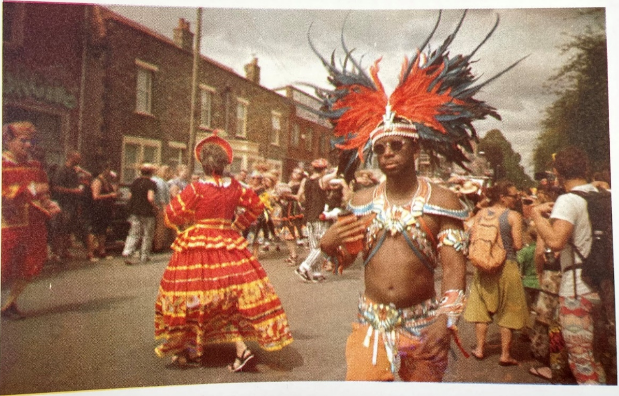
Figure 10: St Pauls carnival dancer, Photoshop separations.

I will get a better scan of this image asap