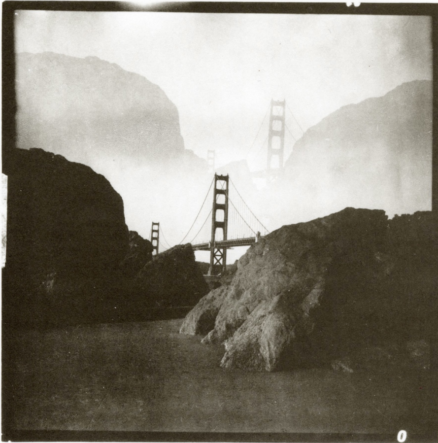
Figure 6: Golden gate, lithograph

Figure 6 is an example where grayscale in the shadows is lost. As pre-press lithographic film we used Arista Ortho Litho 3.0, a high-contrast film, characterized by a very steep gradation and gradation tone, along with a wide density range with high D_{max} and low D_{min} values for enhanced UV transmission. We developed in diluted black and white developer to soften the contrast as recommended for continuous tone. As screen we used technical nylon cheesecloth which produced a screen of 300 lpi. The cloth generates a random pattern since it is soft. The print is 15 cm x 15 cm. The resolution of the detail is excellent, the nylon cheesecloth gives the print a soft quality, but the plate is easily over-inked.