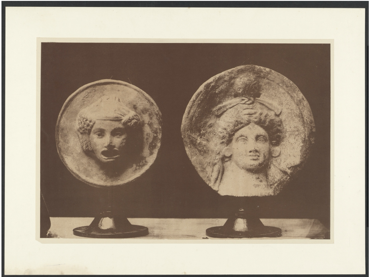
Figure 3: Photolithography by Alphonse-Louis Poitevin. Printer: Lithographie Poitevin

for plate making but on the more manageable and lighter zinc plates. Originally developed for the 'photocopying' of maps, it became the forerunner of modern photolithography when in 1885 the first practical halftone screen production method was commercialised by Frederick Ives [4], the so called 'second Ives process': Two glass plates ruled with opaque lines were sandwiched together at 90 degrees and put in front of a metal plate the image was projected on.