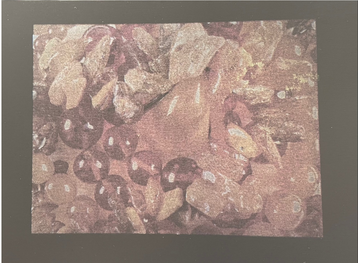
Figure 11, Amber, Merck Spectraval Red, Green and Blue, Black Plike 100 LPI, 15,60,105 degrees, ellipse. Image taken on Iphone 12 pro

process colours with B=Y, G=M and R=C. Printing in this order ensures our contrast and colour balance are correct.