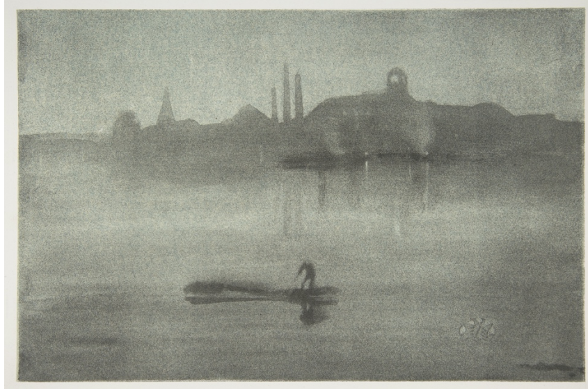
Figure 1: Nocturne: The Thames at Battersea by James McNeill Whistler, 1878. Lithotint with scraping on a prepared half-tint ground, printed in soft gray-black ink on pale blue laid chine mounted on ivory wove plate paper, Source: https://www.metmuseum.org/art/collection/search/337702

With the introduction of colour into the printing process and an increased size of the print bed, lithography revolutionized advertising in the 1880 and 1890, see Figure 2. Almost overnight posters for all kinds of events and entertainments could be printed and distributed.