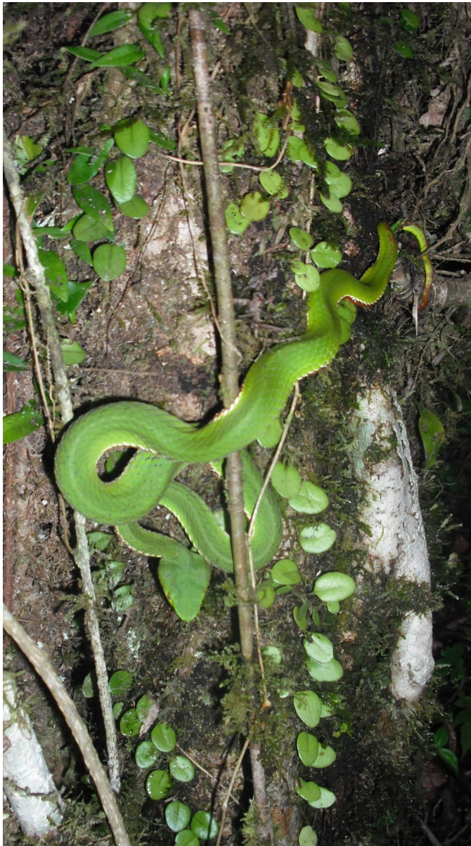
Fig. 5. A Medo Pit Viper ( Viridovipera medoensis ) in riparian habitat in Papum Pare District, Arunachal Pradesh.

142.67 (n = 3) and females 143.50 (n = 4) subcaudals; males 53.33 (n = 3) and females 54.00 (n = 4).