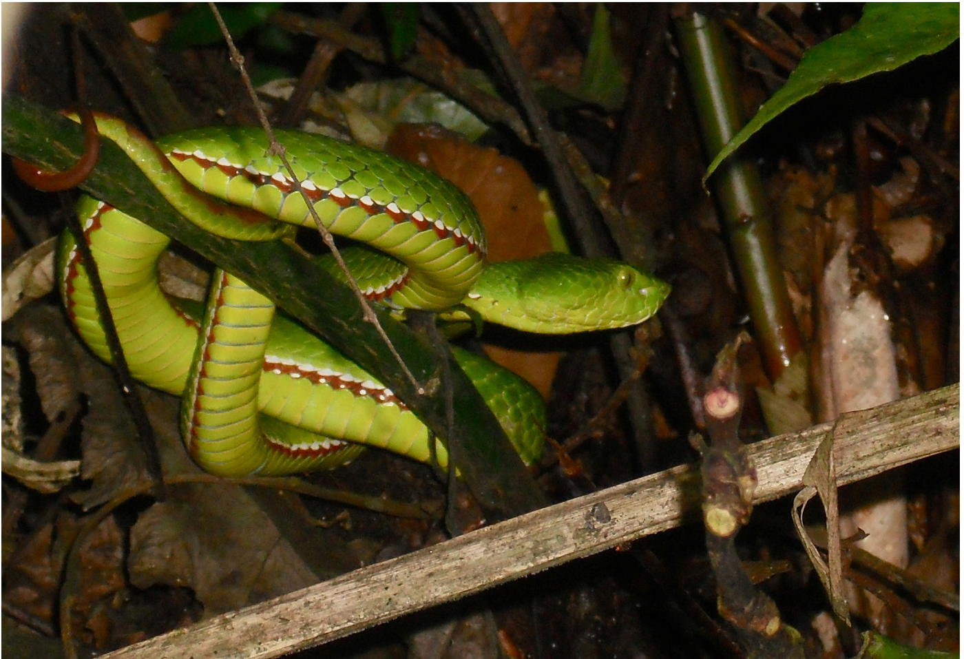
Fig. 4. A Medo Pit Viper ( Viridovipera medoensis ) in vegetation overhanging a small stream in Papum Pare District, Arunachal Pradesh.

Snakes were identified by two morphological diagnostics: Scale rows 17:17:13 and nasal undivided and completely separated by a suture from the first supralabial (Leviton et al. 2003, Whitaker and Captain 2004). Hemipenial structure is also a diagnostic feature (Peng and Fuji 2000), but was not examined during this study. The cloacal scute was entire and subcaudals divided for all specimens. Only counts on mid-body rows were recorded for juvenile identification due to the small size of the snakes and their potential susceptibility to stress during handling. The following mean scalation data were collected from the adults (Table 1): supralabials; males 8.0 (n = 3) and females 8.5 (n = 4) scales between supraoculars; males 9.33 (n = 3) and females 8.5 (n = 3) ventrals; males