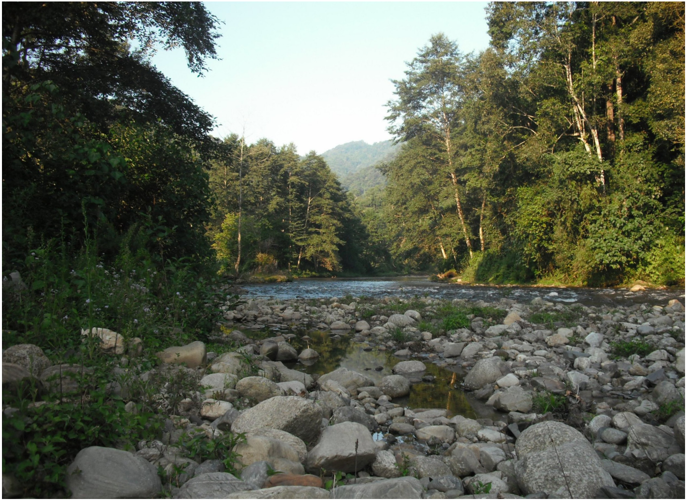
Fig. 8. The Papum Pare River in Papum Pare District, Arunachal Pradesh.