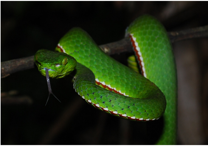
Fig. 3. A Medo Pit Viper ( Viridovipera medoensis ) in Papum Pare District, Arunachal Pradesh.

Temperature and humidity were recorded at the site of each encounter. Temperature was 22.8 \pm 4.17 °C (range 18.9–27.2 °C) and humidity 85.05 \pm 9.98\% RH (range 74.0–93.4% RH). Weather at times of capture ranged from dry and warm to cloudy and overcast.