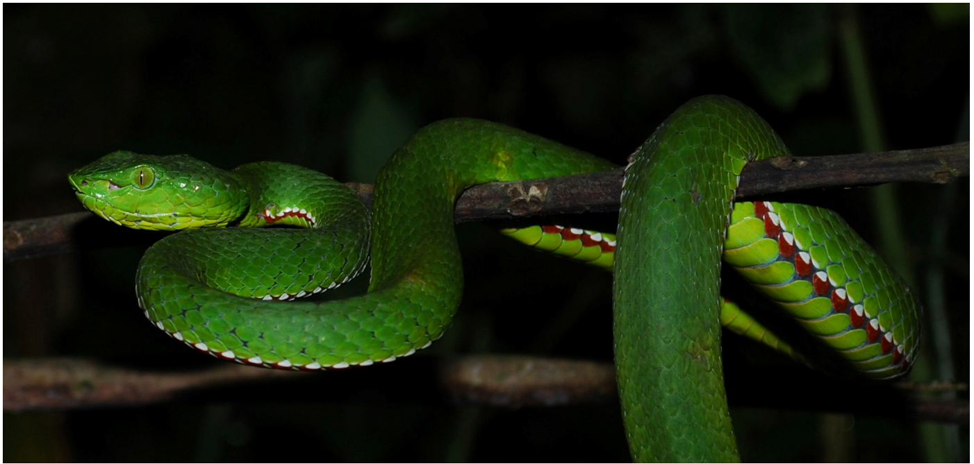
Fig. 2. A Medo Pit Viper ( Viridovipera medoensis ) in Papum Pare District, Arunachal Pradesh.

residents as having pitvipers. Data recorded included environmental conditions and morphometrics; weight (g), snout-vent length (SVL), total length (TL), sex, habitat, and perch height (PH) when possible. Locations of individuals were recorded using a Garmin eTrex™ GPS and mapped using Quantum GIS Ver. 1.8.0.