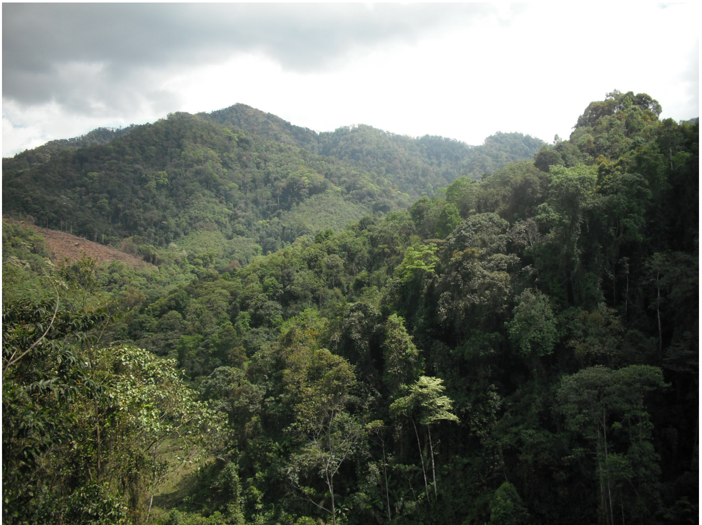
Fig. 7. Subtropical forest habitat of the Medo Pit Viper ( Viridovipera medoensis ) in Papum Pare District, Arunachal Pradesh.

approximately 400 km within Arunachal Pradesh (Fig. 1). Medo Pit Vipers have a patchy distribution and the paucity of known localities across India, Myanmar, and China highlights the need for more surveys across the species' entire range. Further investigations also are needed to decipher the species' population ecology and natural history to help assess its conservation status.