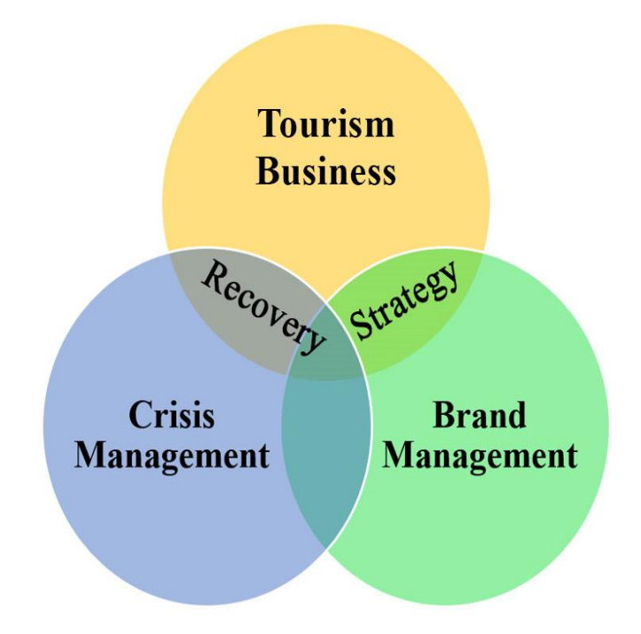
Figure 1. The conceptual model.

Figure 1 depicts our proposed approach, which is guided by brand management and crisis management theories. The rest of the section covers literature around these key theories. Section 2.1 discusses the impacts of crisis and recovery strategies on tourism businesses; Section 2.2 explores crisis management, and Section 2.3 presents the role of brand management during the crisis.