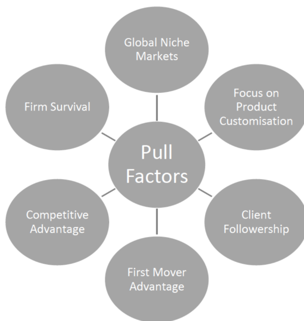
Figure 1. Pull factors in early internationalisation

“Starting to have a look at what the competition was in Europe, we found out that the competition was substandard. Their websites weren’t anywhere near the quality that ours was.” (Company D)