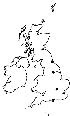
103 104 Fig. 1 Map showing the location of the three study sites, Totternhoe, Brockadale and Wingate 105 (from South to North)

97 three sites have been classified as Sites of Special Scientific Interest (SSSI) by Natural England. 98 As well as being topographically diverse they contain a variety of habitats, including calcareous 99 grasslands where M. galathea is found. Totternhoe is in the core of M. galathea 's UK range, 100 Brockadale is close to M. galathea 's natural northern range boundary and Wingate is beyond M. 101 galathea 's natural northern range limit. The Wingate study population was introduced in 2000 as 102 part of an assisted colonisation experiment (Willis et al. 2009).