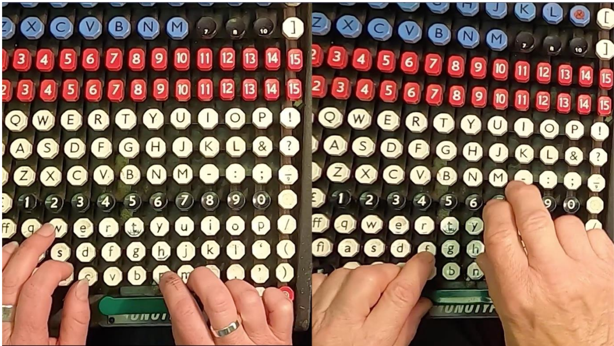
VIDEO 2. Further development of methodology with case studies (duration 10 min 15 s). To watch the video, click the picture

The case studies (see Video 2) provided the researchers with a programme of activities that a tool kit could perform. The desired functions were then outlined using the five Design Dimensions (Wölfel & Merritt, 2013) (Table 1).