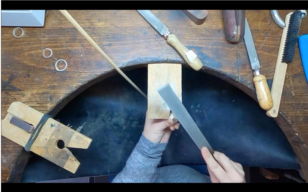
VIDEO 1. Initial development of the methodology: test subjects (duration 7 min 12 s). To watch the video, click the picture