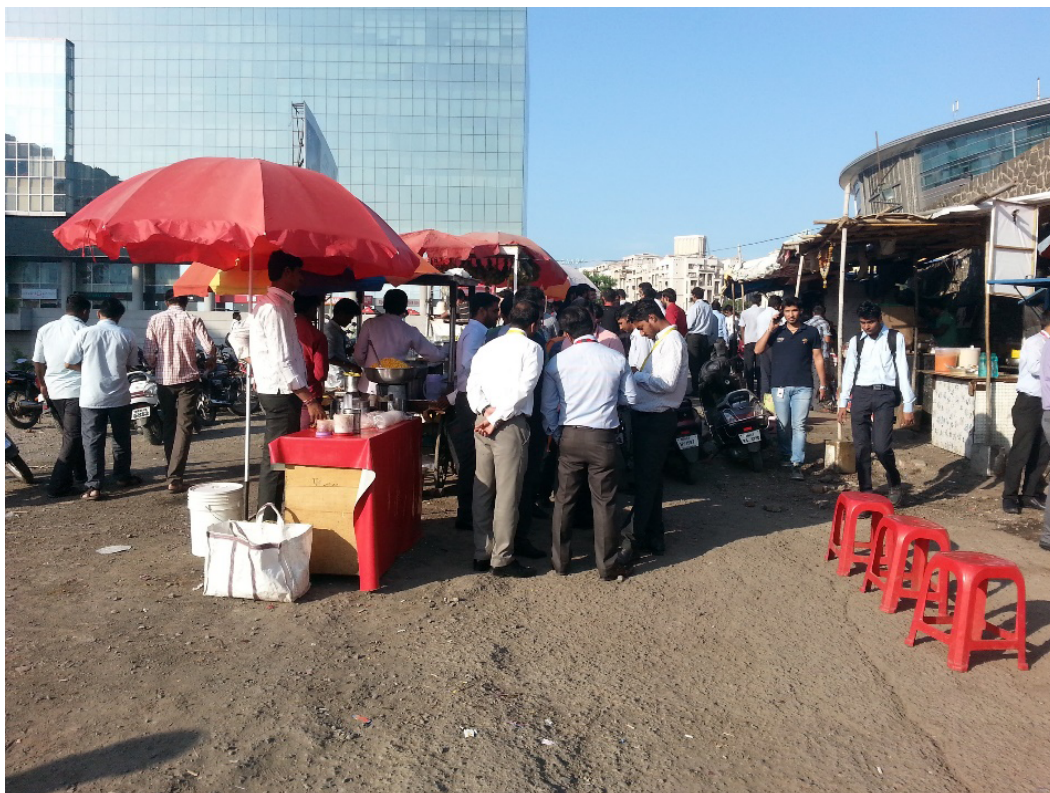
Figure 2. Makeshift food and tea stalls ( Tapri ) outside Eon IT Park in Kharadi.

The two-tiered segmentation of the IT-oriented spaces and labour is further seen in the context of differentiated access to basic services for the different worker classes across most large tech parks in the city. Thus, for example, many workers do not have access to affordable, subsidised food inside corporate messes in these IT parks and come to depend on another more reasonable option—the makeshift roadside food and tea stalls known locally as Tapri (see Figure 2). These spring up organically outside the different office campuses and operate round the clock, just like the global operations that take place inside the IT parks. They, then, become spaces where workers gather during their cigarette breaks before, in between or after their daily work shifts. Here, they discuss workplace politics and share their routine lives with others. These adjoining stalls therefore become important spaces where workers can socialise and express themselves more comfort-