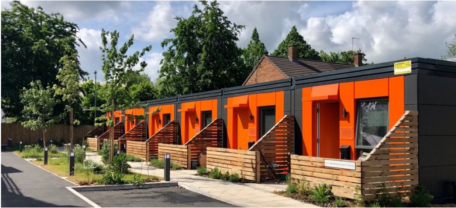
Figure 4- SoloHaus units in Cambridge. 2022