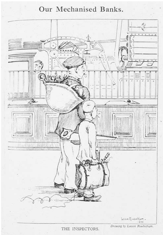
Figure 6. 'Our mechanised banks: the inspectors call', Spread Eagle (1930), p. 531.

and in the branches of the 'Big Five' was the introduction of accounting machines which allowed the posting, or data handling, of bank ledgers and customer statements, both commercial and personal. With accounting machines came standardization as their introduction transformed banking operations with the implementation of procedures designed to ensure all data handling (i.e. data collection, data presentation, data processing, data storage and data retrieval) were systematic and uniform. The specific machines preferred by an individual bank depended upon an assessment of the features supplied and the bank's requirements, but each of the 'Big Five' responded to rising costs and an increase in business, both the number of customers and transaction undertaken, by adopting this technology.