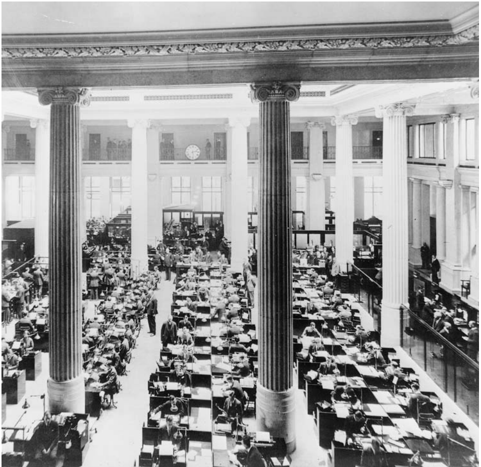
Figure 4. Machine banking in inter war Britain: the central banking hall at Lothbury after the mechanisation of the Westminster Bank's headquarter functions.

It was the branch where most customers came into contact with the bank's staff. Only the most important clients had dealings with head office which scrutinised all major loans