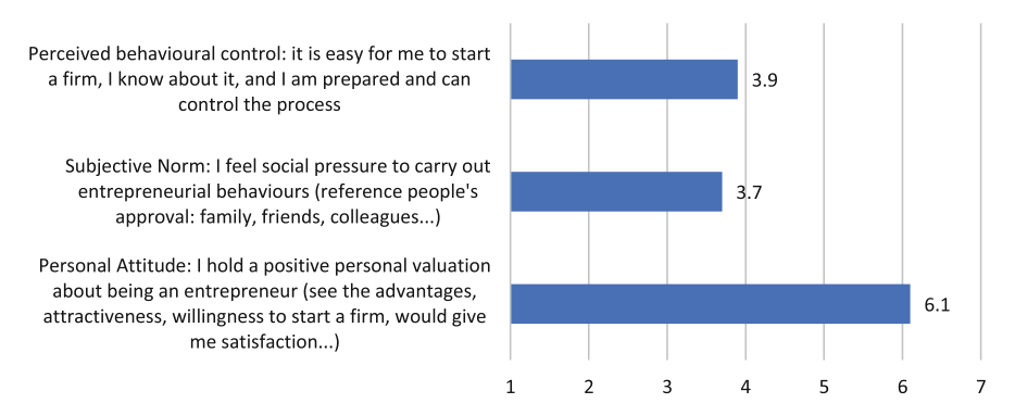
Fig. 1 Attitudes towards entrepreneurship (mean score values). n: 20

Planned Behaviour (TPB) model (Ajzen, 1991), and respondents were asked to rank each of the statements from 1 to 7, where 1 indicates total disagreement and 7 indicates total agreement.