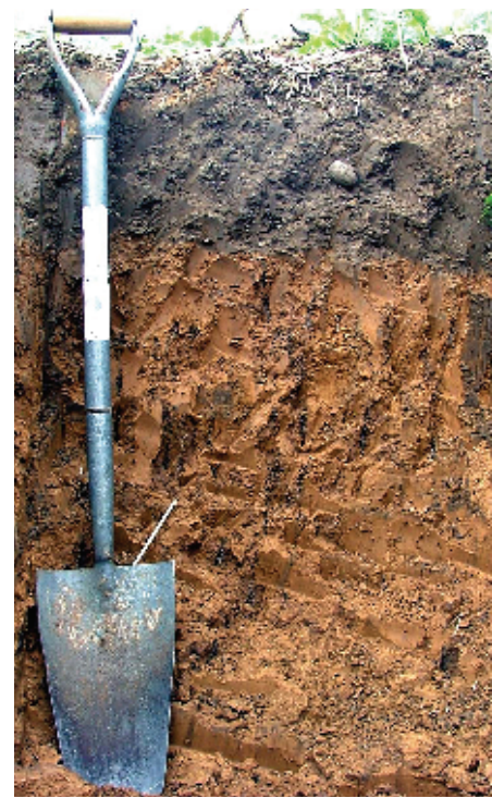
Figure 5 Soil profile pit: useful for studying soil types with depth, investigating rooting depths and sampling soils for chemical analysis.

Sample analysis All samples analysed for Diazinon, metabolites of Diazinon and harmful impurities of the proprietary insecticidal treatment.