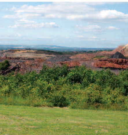
Figure 4 Open-cast working site displaying the variability in site conditions alongside newly planted reclaimed land in the foreground.