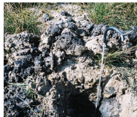
Figure 1 Soil sampling: a hand-dug trial pit to investigate soil characteristics and profile depths.

Soil sampling should only take place once a site history has been ascertained and a conceptual model of environmental conditions and potential risks has been constructed and reviewed as part of a Preliminary Site Investigation Survey (Phase I). Soil sampling forms part of the intrusive site investigation (Phase II) and provides data for the processes of site evaluation and risk assessment. Subsequently, a risk management strategy is devised for all the identified risks (Phase III), or a site action plan may be devised, for example, for adjusting the soil conditions to suit vegetation establishment. As such, soil sampling should be undertaken by qualified environmental consultants. An introduction into the site selection and risk assessment processes for identifying suitable locations for greenspace establishment is given in an FC Information Note (Doick and Hutchings, in preparation): Greenspace establishment on brownfield land: the site selection and investigation process . Additionally, in-depth information on the procedures involved in site assessment can be obtained from the FC Land Regeneration Unit (England): Phase 1 Survey specification – preliminary site investigation and feasibility reporting on potential community woodland sites .