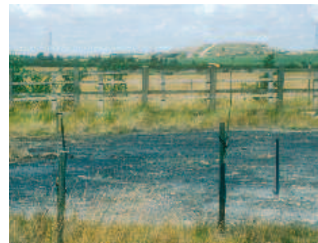
Figure 6 Seven-year-old tree planting on an acidic colliery spoil in the West Midlands, England, showing total mortality.

Subsample of the samples analysed for electrical conductivity, total S, available N and P, total N, plus Ca, Mg, K, Fe and Mn.