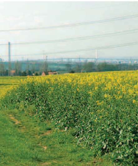
Figure 3 Typical farm setting showing oil seed rape as a main crop. Soil analyses will consider nutrient status and presence of a plough pan.