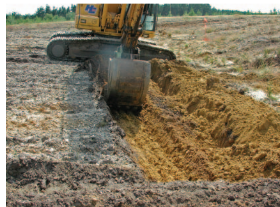
Figure 1 An excavator removing soil.