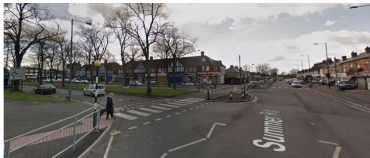
Figure 8: Olton Boulevard East/Summer Rd., Birmingham

The following issues emerged from the comments made on this junction: