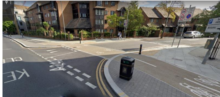
Figure 7: Denmark Rd./A24, Kingston, London

The following issues emerged from the comments made on this junction: