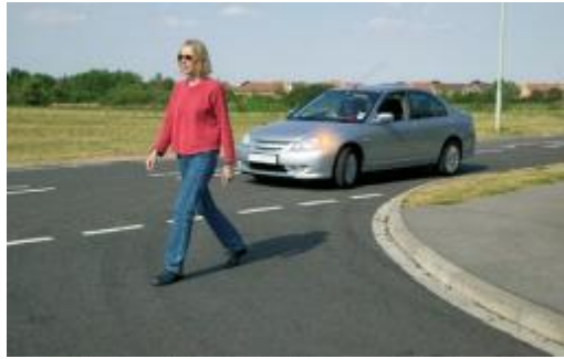
Figure 1: Example of a typical side road crossing