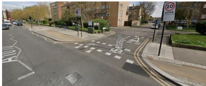
Figure 11: Sebastopol Rd./Fore St., Enfield, London

The following issues emerged from the comments made on this junction: