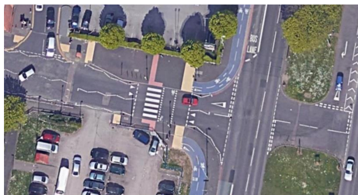
Figure 3: Milton St./A34, Birmingham

The Milton Street/A34 junction in Birmingham has a full set-back parallel crossing, i.e. with a zebra crossing. The cycle track is bi-directional and lies adjacent to the main road kerb line on one side of the junction and at the rear of the footway on the other side. It is quite a complex junction lying adjacent to a busy dual carriageway (the A34), with turns to the opposite carriageway being made via a link road across the central reserve. This is part of the Birmingham's Blueway cycle network and extends from the city centre to Perry Bar. Cycle priority is given at most side road junctions along this route. The enhancement was made in about April 2019. The junction is shown in Figure 3.