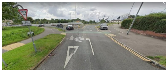
Figure 5: Wykebeck Valley Rd./York Rd., Leeds

The following issues emerged from the comments made on this junction: