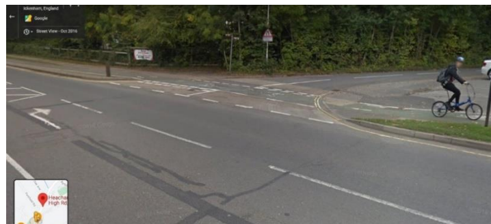
Figure 9: High Rd./Austin's Lane, Ickenham, London

The following issues emerged from the comments made on this junction: