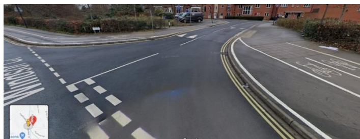
Figure 2: Hallfield Rd./Windsor Cl., York

The following issues emerged from the comments made on this junction: