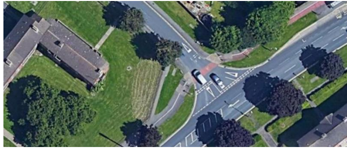
Figure 6: Hesters Way Rd./A4013, Cheltenham

The following issues emerged from the comments made on this junction: