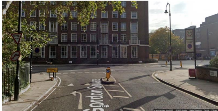
Figure 10: Byng Place/Gordon Sq., St. Pancras, London

The following issues emerged from the comments made on this junction: