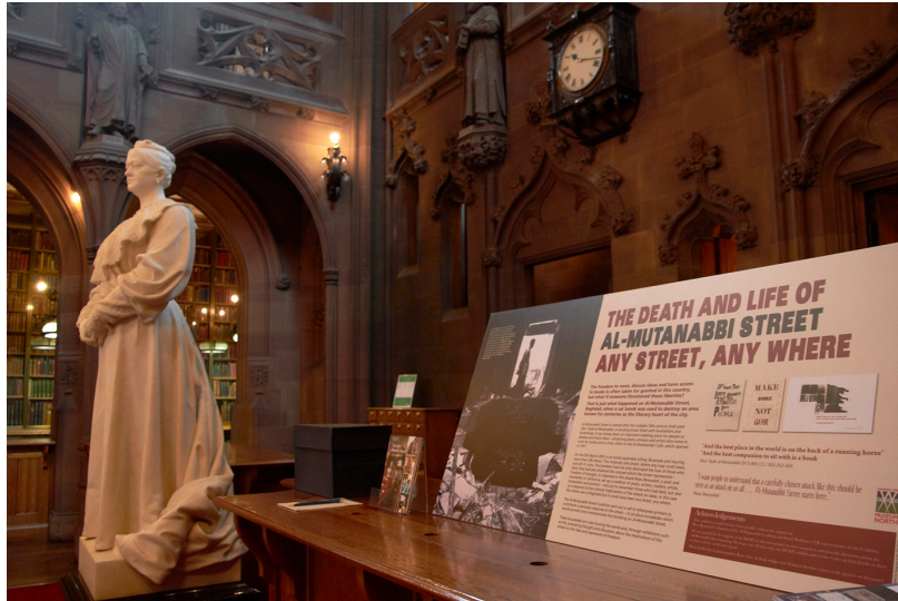
Above and below: The Death and Life of Al-Mutanabbi Street exhibition at The John Rylands Library, Manchester, UK, 07/04/11 - 26/06/11.