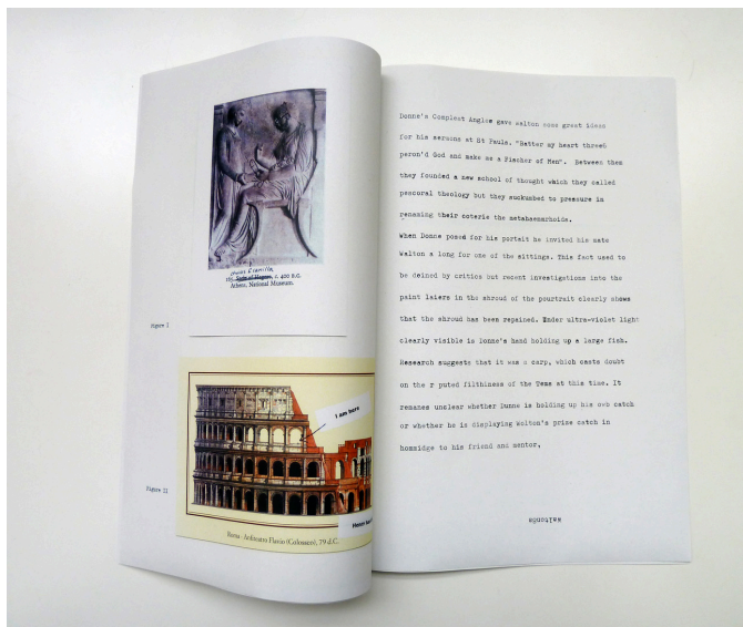
The Secrets of Metahemeralism by Anonymous, 2012. World Book Night tribute to Donna Tartt's novel The Secret History . Contributors brought typewriters, paper, inks, pens, pencils and cameras. The typed version of the group's collaborative essay: 'The Secrets of Metahemeralism', written (awfully) in the style of Bunny Corcoran was used as the basis for the artist's book along with postcards, photographs and messages on scraps of paper sent in for the project.