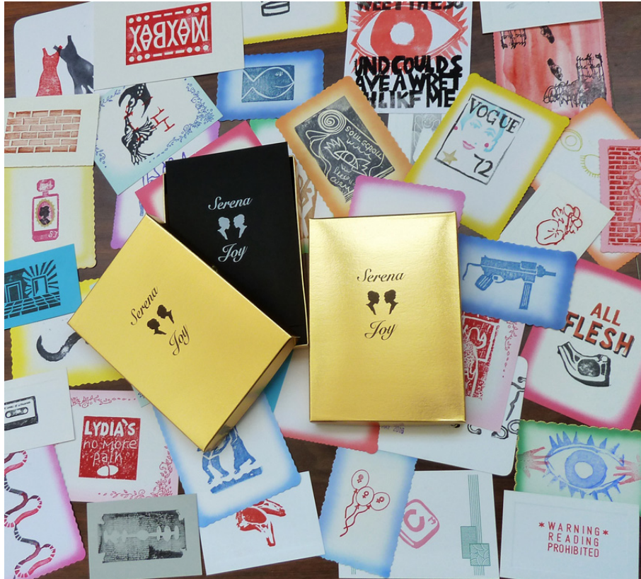
World Book Night 2016. Perfectly summed up by contributor Jeremy Dixon: 40 artists, 16 stampers, one day = Serena Joy .