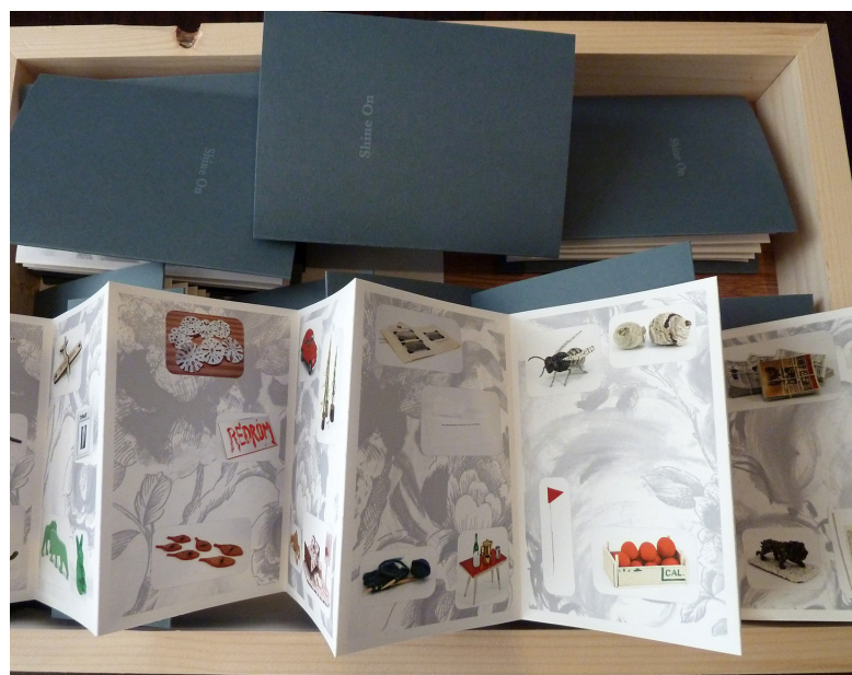
Shine On , 2015. World Book Night tribute to Stephen King's novel The Shining . The open call asked contributors to read the book and make a miniature model of anything in it. These were photographed, matched with text and arranged sequentially to narrate the tale visually in the artist's book and video.