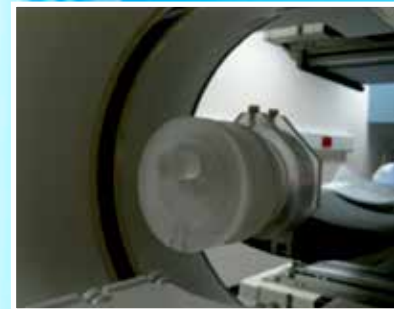
Figure 4: Quality control section of the CT Competencies document.