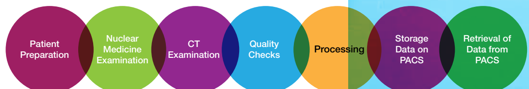
Figure 1: Typical steps involved in the completion of a SPECT/CT examination.

Consideration as to the importance of organisational workflow and the adaptation of new skills following the introduction of new technology, has been studied extensively by Barley 12 and Schoenhofer and Boykin 13 . Both studies link to