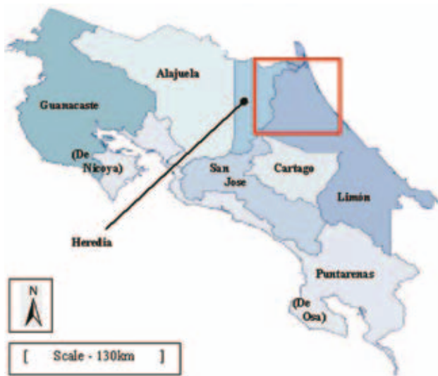
Fig. 5. Costa Rica’s provincial and northeastern zone.

Nocturnal visual encounter surveys (VES) (Heyer et al. 1994) were conducted on known trails and transects at Caño Palma Biological Station to locate Corallus annulatus . We were alerted to some additional individuals by local residents. Data recorded included morphometrics: Weight (g), snout-vent length (SVL), total length (TL); as well as sex, habitat, diet, and perch height (PH), where possible. Survey and morphometric measurements were carried out under research permits granted by the Ministerio