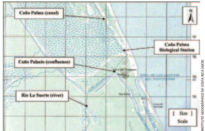
Fig. 6. Lithograph showing the approximate location of Caño Palma; the location of the Río La Suerte and the Caño Palacio/Caño Palma confluence.

Nocturnal visual encounter surveys (VES) (Heyer et al. 1994) were conducted on known trails and transects at Caño Palma Biological Station to locate Corallus annulatus . We were alerted to some additional individuals by local residents. Data recorded included morphometrics: Weight (g), snout-vent length (SVL), total length (TL); as well as sex, habitat, diet, and perch height (PH), where possible. Survey and morphometric measurements were carried out under research permits granted by the Ministerio