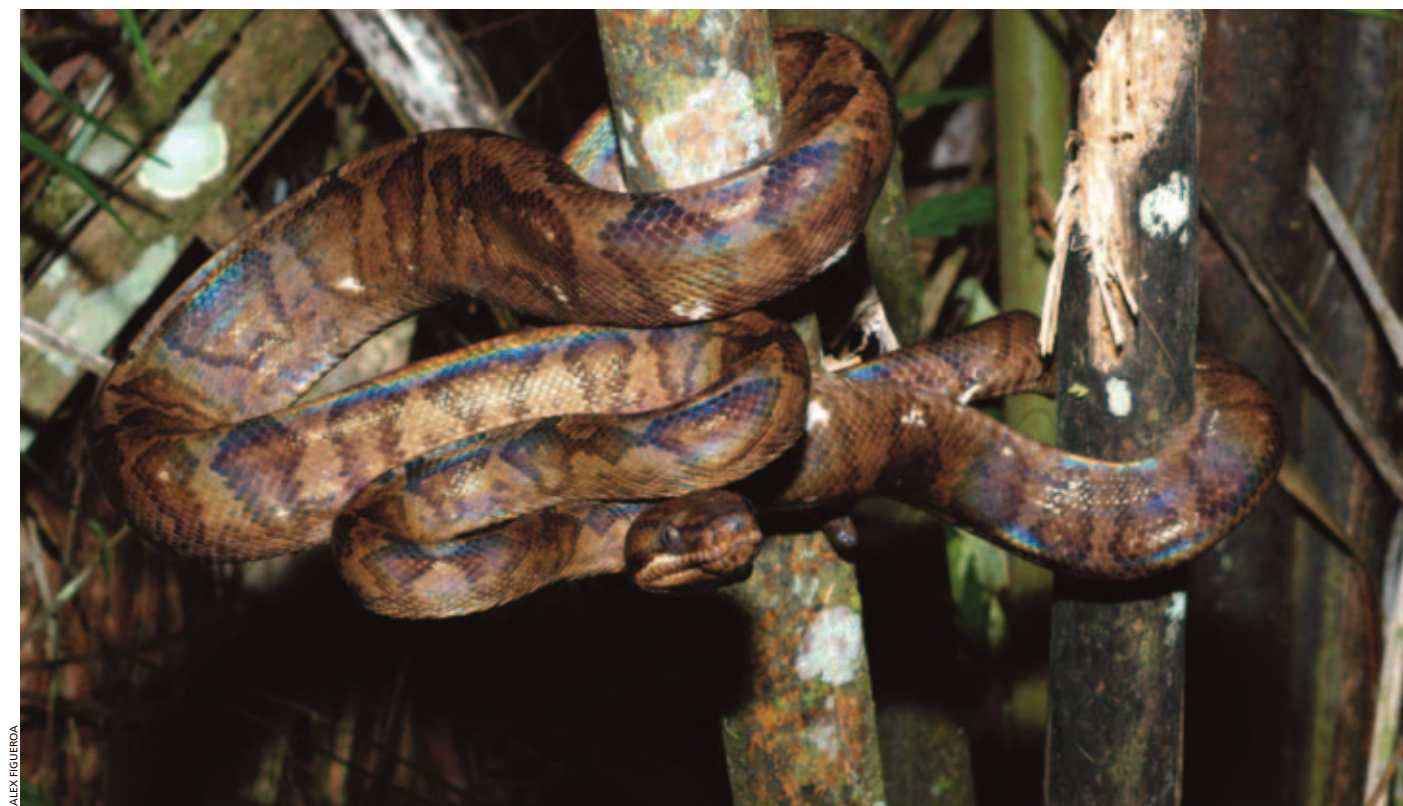
Fig. 3. Corallus annulatus from the Caño Palma Biological Station.