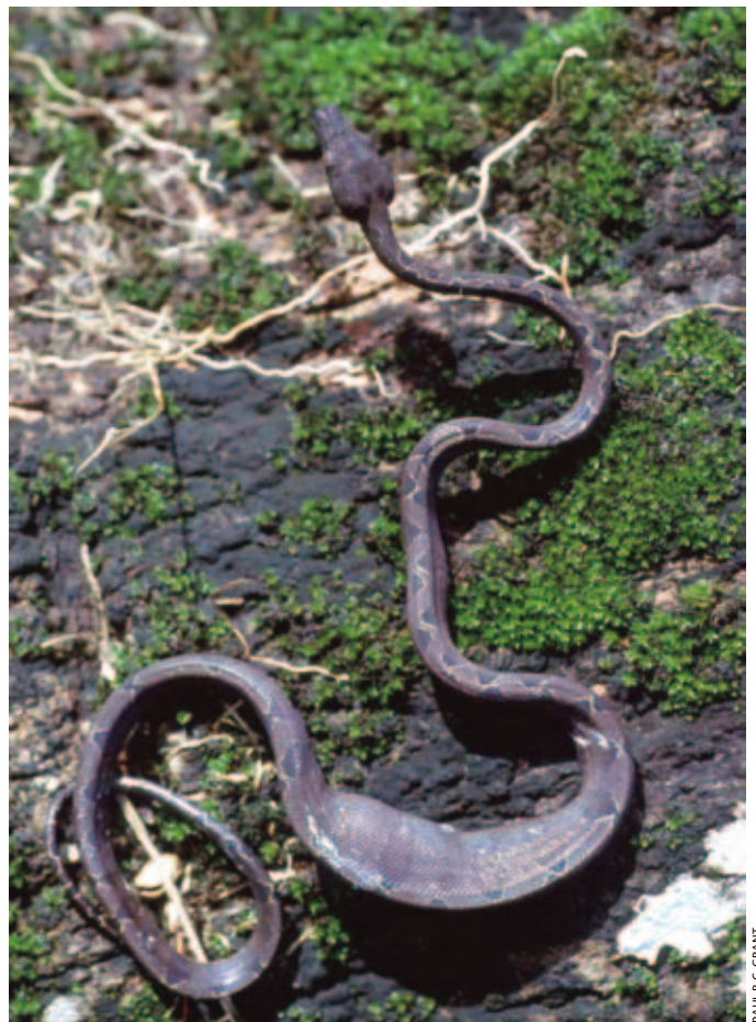
Fig. 1. Corallus annulatus in a palm ( Raphia taedigera ) at the Caño Palma Biological Station.