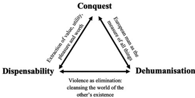
Figure 1. The decolonial triangle of violence.

committed by the Nazi regime in Europe had been preceded and instructed by centuries of similar forms of violence in colonial settlements. In his understanding, the Holocaust was not rendered horrific because it constituted an offense to the very idea and essence of humanness, as Hannah Arendt would have it. 60 The Holocaust was experienced as grotesque because, for the first time, the old colonial procedures that ‘had been reserved exclusively for’ 61 the victims of European colonialism were employed on Europeans themselves.