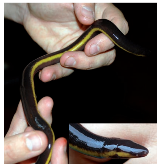
Figure 9. Ichthyophis beddomei. ▲