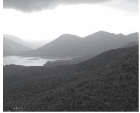
Figure 1. Primary tropical deciduous Rainforest bordering ARRS. ▲

Figure 2. Semi-evergreen forest habitat at Wildernest. ▲ ►