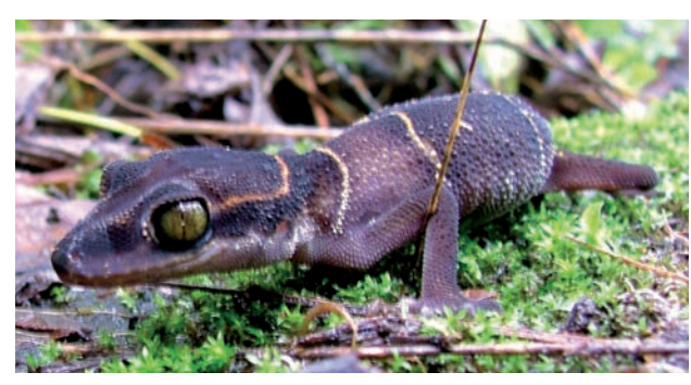
Figure 12. Geckoella deccanensis.

Figure 11. Hemidactylus maculatus hunae. ◀