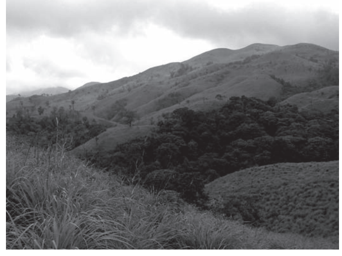
Figure 4. Montane evergreen forest with and Chorla grassland habitat. Photograph by Rowland Griffin 2008. ▲

secondary semi-evergreen and wet deciduous types (Fig. 2). The Nature Conservation Facility has been established at Chorla Ghats to assist research and long-term monitoring of the Western Ghats of the Sahyadris region. The project is providing a platform for ecologists and wildlife biologists working in the Chorla Ghats and is a fully equipped field station. Wildernest was visited in June 2008.