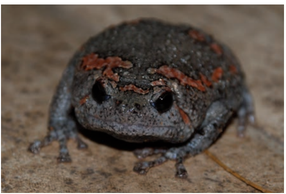
Figure 10. Kaloula taprobanica . ▲