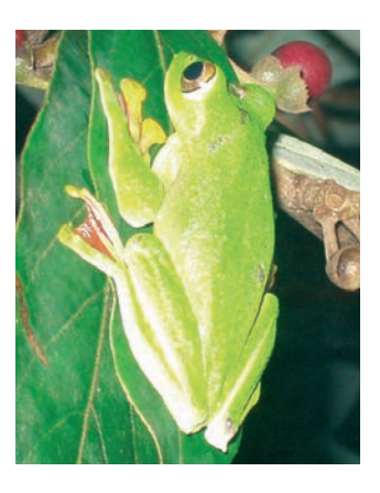
Figure 8. Rhacophorus malabaricus. ►