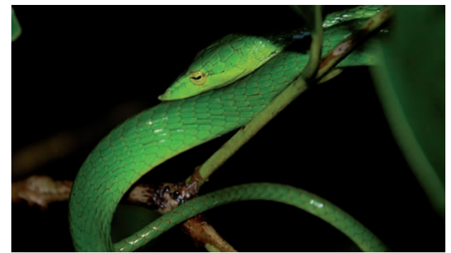
Figure 19. Ahaetulla nasuta. ▲

Figure20.Lycodonaulicus.▲