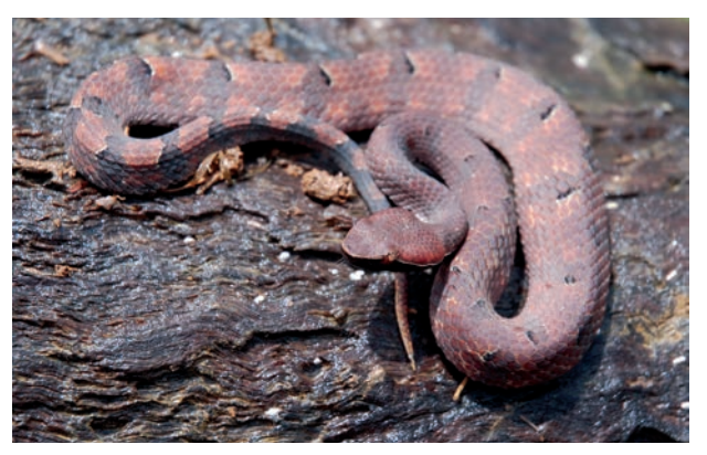
Figure 18. Hypnale hypnale . © John Thorpe-Dixon 2008. ▲