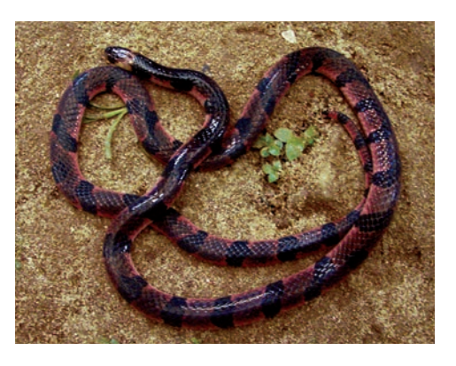
Figure 22. Amphiesma beddomei. ◄

Figure 21. Calliophis bibroni. ►