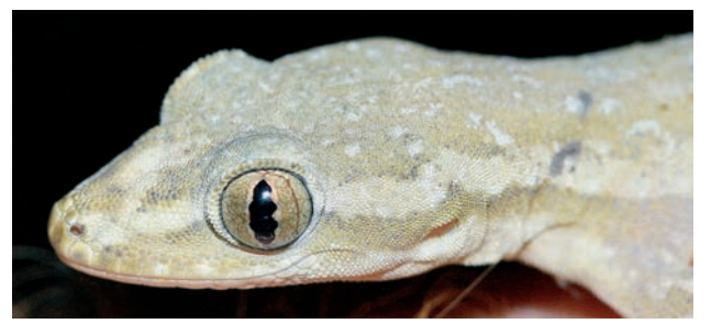
Figure 16. Hemidactylus maculatus. © Jacqui Turner and David Willis 2008. ▲