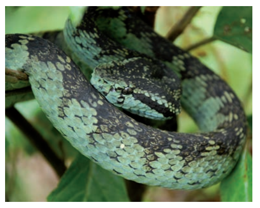
Figure 17. Trimeresurus malabaricus . ▲