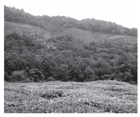
Figure 3. Tea plantation with mixed forest. Photograph by Todd Lewis 2008. ▲

Figure 2. Semi-evergreen forest habitat at Wildernest. Photograph by Steve Lloyd and Michaela Clapson 2008. ▲ ►