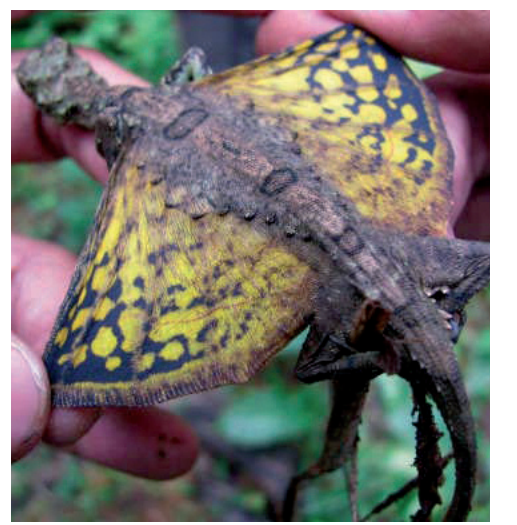
Figure 15. Draco dussumieri. ▲