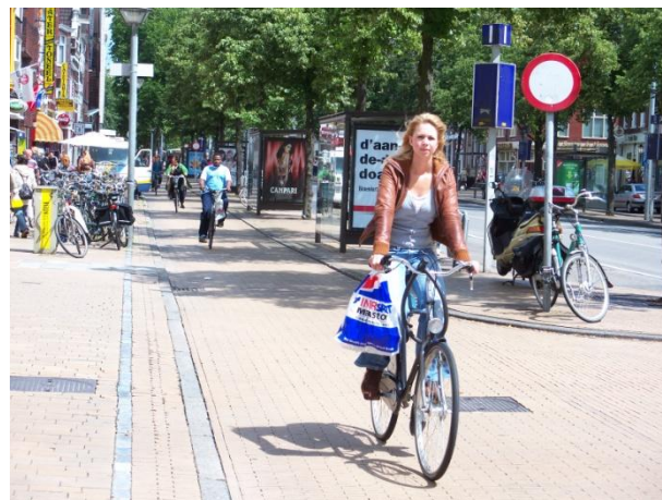
Figure 4 Groningen Inner Ring road