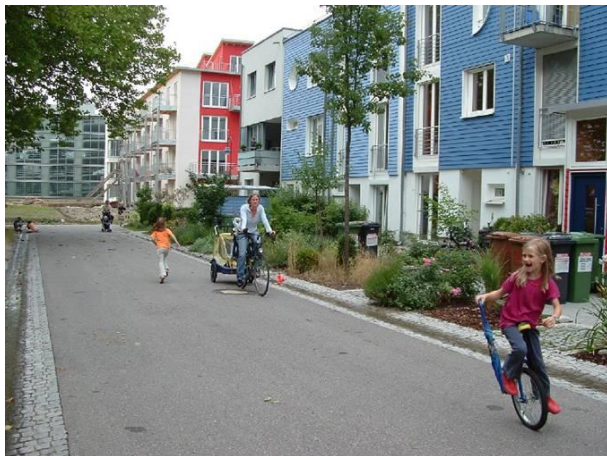
Figure 1 stellplatzfrei street, Vauban, Freiburg

Although vehicles are physically able to drive down the residential streets, and the no-parking rules are not effectively enforced, in practice, vehicles are rarely seen moving on the stellplatzfrei streets. Signs emphasise that children are allowed to play everywhere, and in the absence of moving traffic, children are more evident (Figure 1) than in the more conventional home zones and traffic-calmed streets common elsewhere in Freiburg.