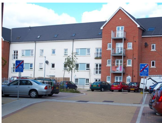
Figure 6 Poole Quarter 'home zone'

The site had been developed at higher than usual densities for that area (108 dwellings/hectare). This meant that even with the lower than usual parking ratios the area between the housing was largely filled with parked cars. An area designated as a home zone (Figure 6) was rarely used, as intended, for children's play; a lack of green spaces or play areas was cited as a problem by 31% of respondents. The most frequently cited problem, by 57%, was lack of parking. Conflict between neighbours over limited parking spaces was mentioned by several interviewees. When residents were asked why they moved to Poole Quarter, most mentioned the accessibility of the site, but none mentioned anything relating to the low car concept or the travel plan – this was a notable difference from the European carfree developments.