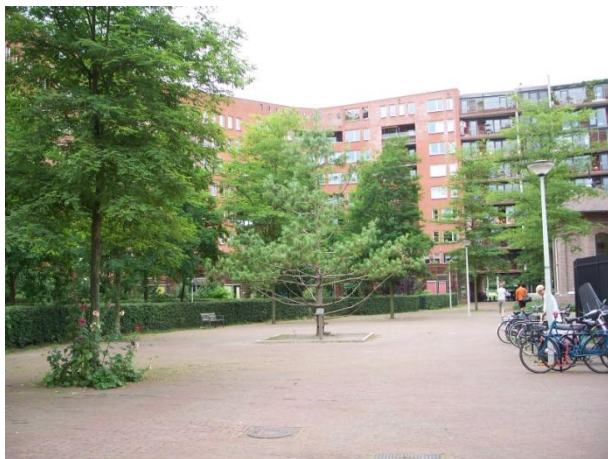
Figure 3 GWL Terrein, Amsterdam

GWL Terrein and Stellwerk 60 are both larger: around 600 and 400 dwellings respectively. Stellwerk 60 includes some houses as well as apartment blocks, with pedestrianised streets between them. Removable bollards restrict access to the core of the site. A residents' organisation controls these bollards which are removed for a limited range of vehicles such as removal vans and emergency vehicles, but not for general deliveries, which are done by hand, sometimes using trolleys or cycle trailers (Figure 2). In the case of GWL Terrein, the blocks of up to 8 storeys high have been built around semi-private space where vehicles cannot penetrate (Figure 3). Entrances to the blocks are all fairly close to the perimeter, where some time-limited parking is available. Peripheral parking, mainly in multi-storey blocks is provided at a ratio of around 0.2 in both sites, allocated by ballot in GWL Terrein, and separately sold in Stellwerk 60.