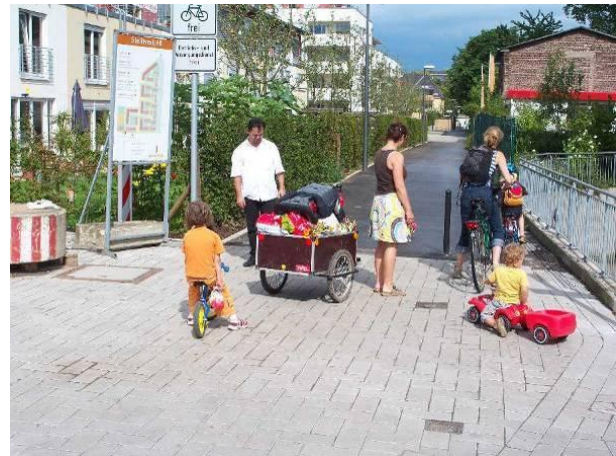
Figure 2 Access to Stellwerk 60, Cologne