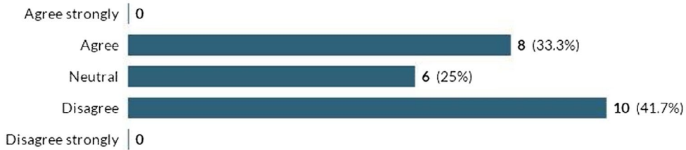
Figure 2. Satisfaction with evaluation funding/commissioning process.

Prompt: "I am satisfied with the process of matching needs and expectations between project evaluation and funders/commissioners".