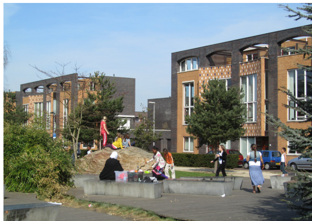
The Kop van Zuid neighbourhood

In Kop van Zuid, south of the city centre, a former harbour area has been redeveloped into a vibrant mixed use residential area. The local authority has tried to encourage families to move into the area through the provision of family housing, schools and playgrounds.