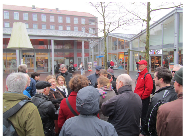
Each neighbourhood has a local centre which provides a mix of retail and residential uses.

The development is divided by an existing train line. To minimise the impact of this segregation on the community, the train tracks were raised to allow connectivity between the two sections of the development. This also provided the opportunity to increase capacity of the train line by adding an extra track.