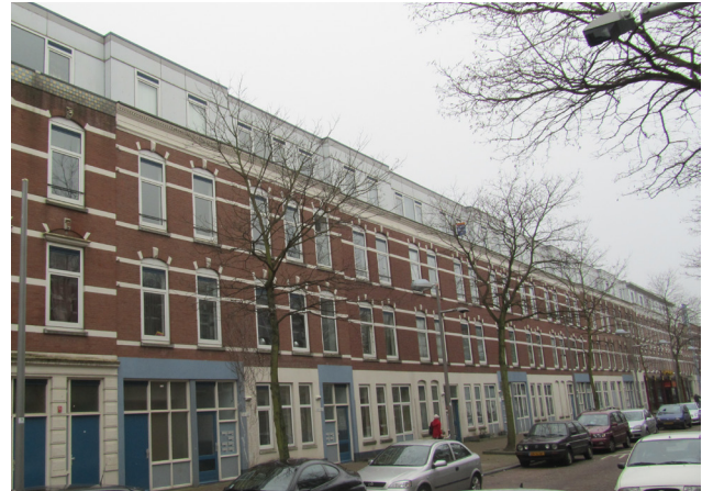
Additional dwellings built on top of existing terrace houses