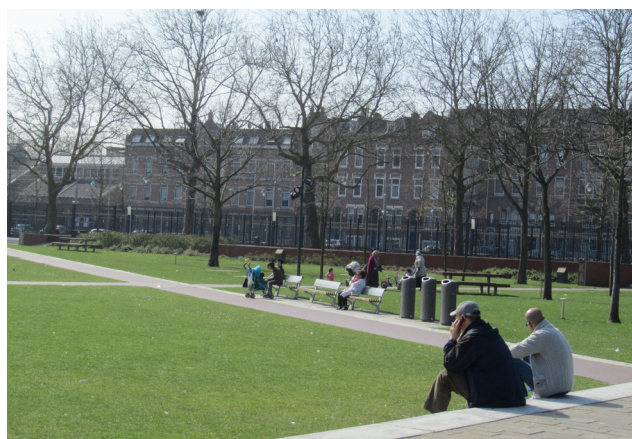
Afrikaanderplein, a catalyst regeneration project

On the edge of Kop Van Zuid is the Afrikaanderplein, a former football ground which has been redeveloped into a functional public park that includes a children's playground, aviary and hosts a weekly market.