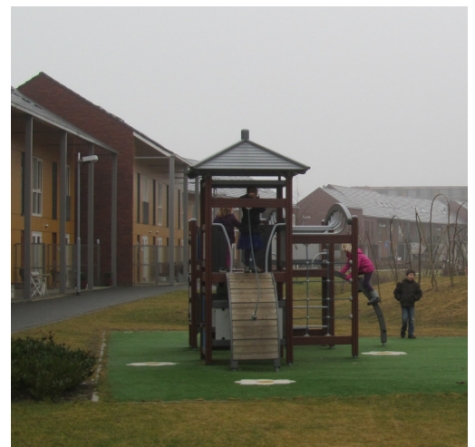
Children's play areas are overlooked by housing in Leidsche Rijn

Local issues, such as making the most of assets and ensuring their sustainability were also creatively addressed. Buildings were designed to be flexible in their use, both for different purposes. For example, including flats on the top floor of a school building that could be converted into classrooms if the school needed to expand. Another example was using the roof space on buildings for play space. Children's playgrounds were also integrated into the neighbourhood design. They were unfenced areas and were within the view of homes.