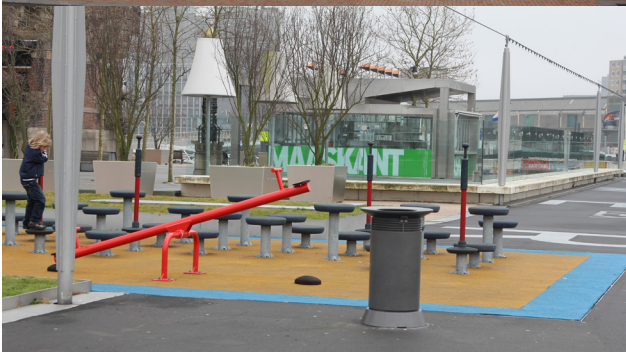
Children's play space outside the Hotel New York on the Wilhelminapier.