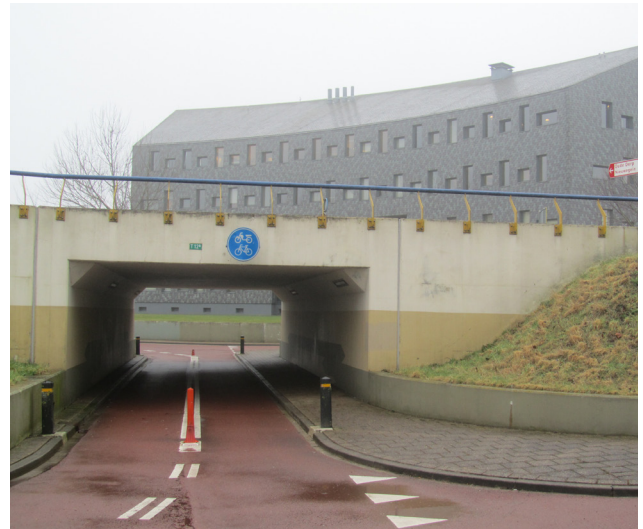
Crossing the road 'the easy way' in Houten

There are two main centres in the city, each with a train station, as well as a historical village centre which the development was built around. Houten North (Houten-Noord) was developed in the 1990s and Houten South (Houten-Zuid) is a more recent urban extension.