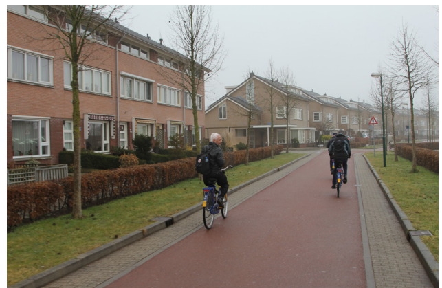
A comprehensive network of designated cycle paths