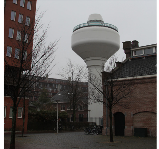
The old waterworks tower and historic buildings are retained at GWL Terrein

In the Netherlands, people are engaged to define the problems in the area, to identify values and to help develop solutions. This was particularly pertinent in the GWL Terrein development in Amsterdam where residents were empowered to participate in the design stage of the development, designing homes, gardens and facilities. There was a greater delegation of responsibility to communities and the sense of ownership of common facilities and open space is evident.