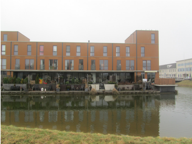
The development uses the natural features of the site to enhance the neighbourhood

The neighbourhood centres seek to provide local shops and services. They are mixed use and incorporate public art and high quality landscaping. Shared facilities and community spaces are a fundamental part of each neighbourhood. The integration of private and social housing is a key feature of the Leidsche Rijn. Some of the neighbourhoods provide co-operative housing that have shared communal laundry and dining facilities and services.