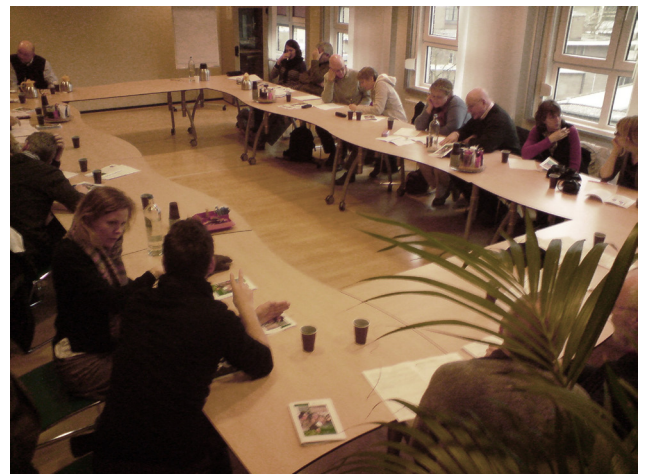
Learning Zone 3: at the Rotterdam Healthy City offices