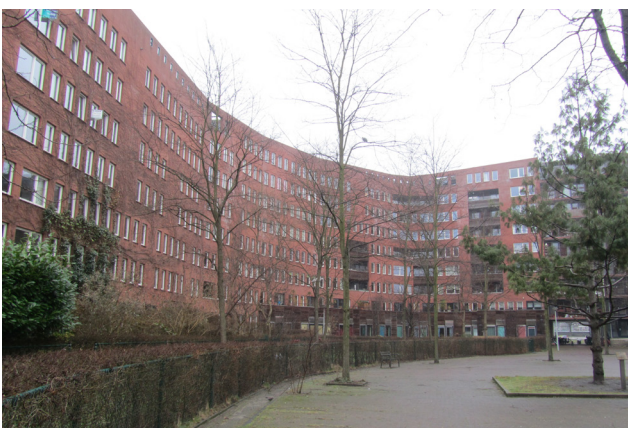
Higher density apartments. The ground floor are assisted care units

The development has successfully created well-used green space that is protected from the noisy surroundings of city life. Art, furniture and facilities for games are a key feature of the development. The development also has a very successful community allotment and has an abundance of bird life in the many bird boxes and nests incorporated into the building fabric.