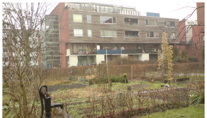
Community allotments in GWL Terrein

GWL Terrein: a former municipal waterworks located three kilometres from the centre of Amsterdam. The site was regenerated in 1989 into a car free residential area (645 dwellings with a mix of tenures) that has influenced not only car use as well as a shift in transport modes. It includes environmentally friendly design that is permeable to adjacent neighbourhoods. The development offers a vibrant example of how low carbon community and sustainable practices in the urban environment that encourage community engagement and activities.