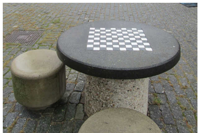
Community chess board in the public realm