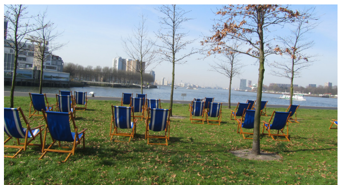
A public park overlooking the Meuse River in Rotterdam

Rotterdam: a former harbour area, Kop Van Zuid is located on the south bank of the Meuse River in the city of Rotterdam. It was redeveloped into a new mixed use town centre thanks to the vision of the local authority. Afrikaanderplein is a former football ground that is adjacent to the Kop Van Zuid area. This site was redeveloped into a very functional public park offering a weekly market, play ground and aviary in an area of the city characterised by cultural diversity.