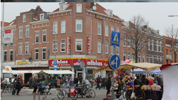
'Shell only' apartments are made available for young professionals to buy and fit out themselves. In the foreground is part of the weekly market at Afrikaanderplein.