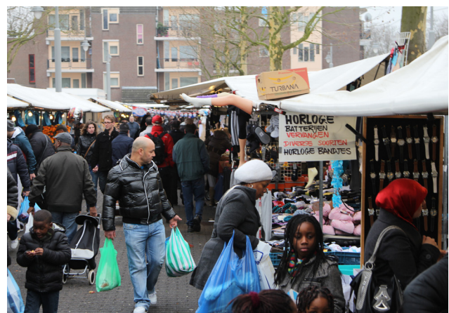
The weekly market at Afrikaanderplein