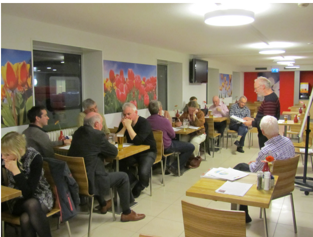
Learning Zone 2: at IBIS hotel

Given the differences in cultures, planning systems and development practice, what lessons should we be exploring, sharing and enacting in the south west?