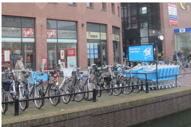
Cycle parking facilities at the local supermarket

The function of the settlement has been considered at all scales - from small pocket parks to the overall transport network. Parks and water bodies are incorporated into the settlement layout and have been treated differently in Houten North and Houten South. In the north, the green spaces and waterways have been designed in a linear pattern, while in the south they are incorporated as a central feature and focus of the area.