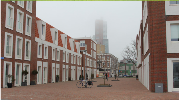
New terrace houses and pedestrian street with the skyline of Rotterdam in the background.