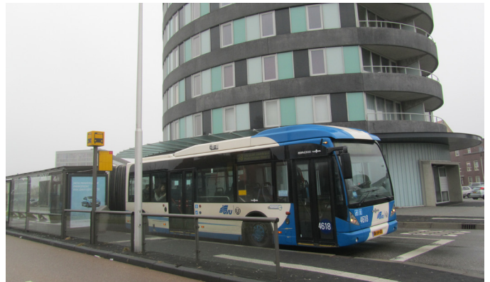
Public transport in Leidsche Rijn

Leidsche Rijn: an urban extension to the city of Utrecht. Once complete, Leidsche Rijn will add an additional 30,000 homes and 180 commercial and public buildings. A new major transportation system is being put in place and neighbourhoods within the development are individually designed and constructed with varying architecture and layout. This allows flexibility to respond to local situations and meet the needs of 'target groups' such as communal elderly housing or live/work units for artists and former homeless.