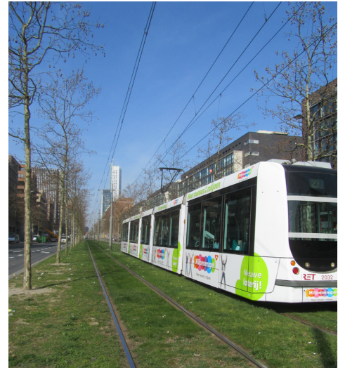
Integrated transport in Rotterdam