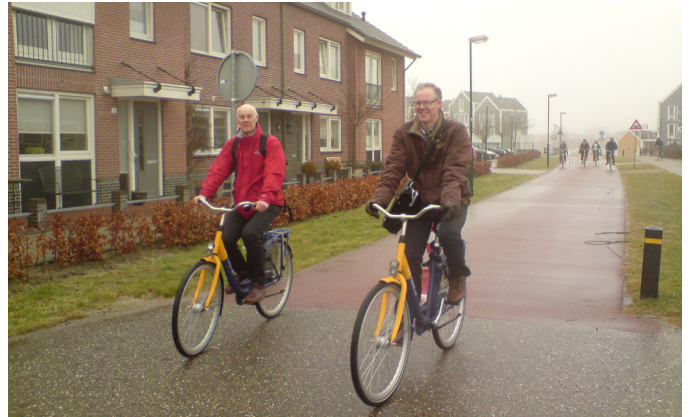
The extensive cycle network in Houten

Houten: a town is situated in the province of Utrecht. Settlement in Houten dates from Roman times, but its modern day growth as a commuter town started in 1966. It was developed to meet the housing needs of Utrecht, growing in population from 4,000 people at the end of the 1970s to almost 50,000 today. Well served by train, buses and motorways, Houten is famous for its status as Netherlands 'Bicycle City 2008'. The settlement has a wide network of bicycle paths that connect different districts in the town and relegates cars to the outer ring road.