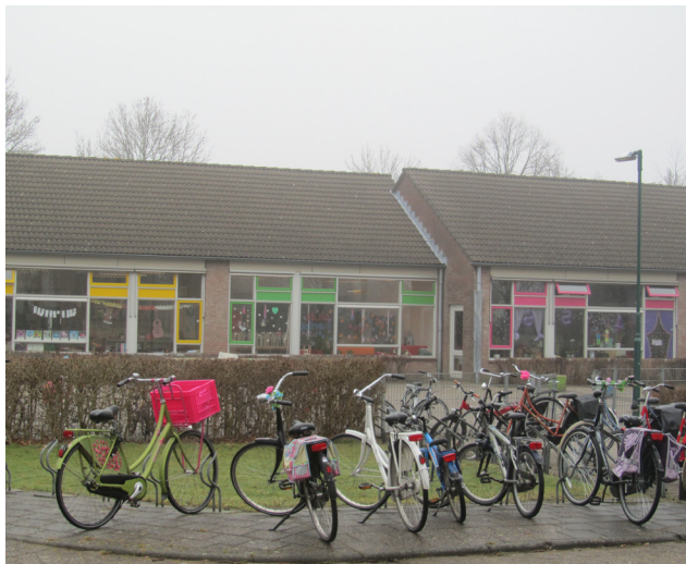
Cycle parking outside the school in Houten

Attention has been given to the cycling experience and the comfort and convenience of the cyclist. Cycling infrastructure is integrated into the layout of the settlement and facilities are located in convenient and accessible locations making cycling the easy option.