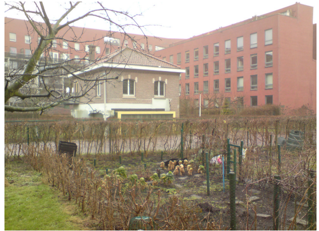
Community gardens and the old pump house

The development has good connectivity and fits well in the urban form of the area. It has also successfully utilised the existing buildings on site, creating a sense of place and link to the history of the site.