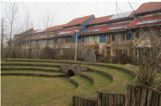
Common space overlooks by residential dwellings

Attracting inward investment and involving local businesses in planning and design was important in maximising opportunities for training and apprenticeships in construction as well as future management and service delivery. The local authority has sought to encourage an alignment of strategies for local jobs and skills with the housing development.