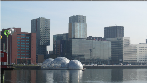
The Rotterdam floating pavilion, a showcase of the City's water management, sustainability and the ambition for a floating residential community in this area previously used as a dock.