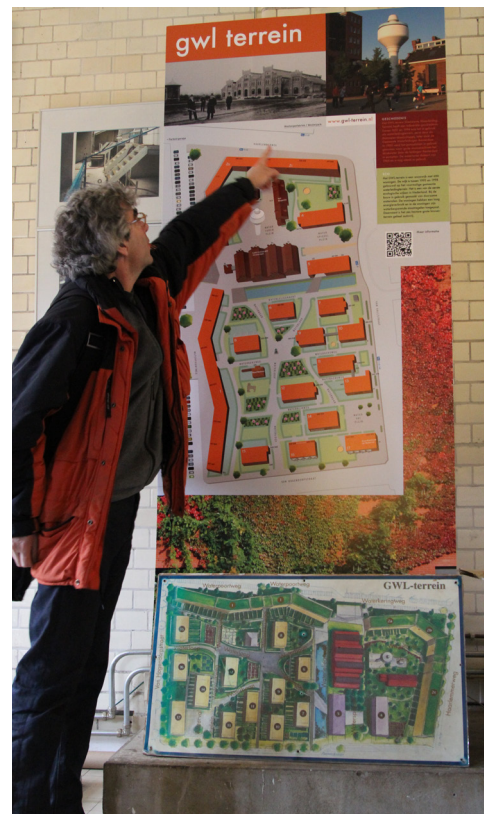
A resident of GWL Terrein explains the masterplan

Participants on the study tour recognised that land control is critical to delivering a development such as the ones visited in the Netherlands. But even though the framework for development is quite different in the United Kingdom than in the Netherlands, participants emphasised that this should not be used as an excuse not to try to deliver the same level of quality and consideration. There are projects moving forward in the United Kingdom where opportunities for land assembly, land capture and development commissioning can help to deliver exemplary developments like GWL Terrein.