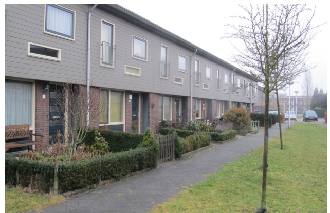
Sustainable urban drainage systems are well-designed