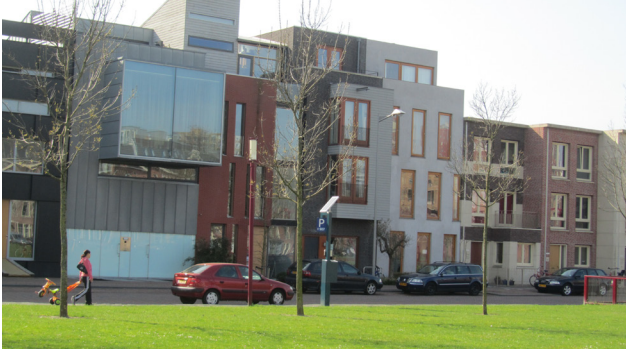
New residential development and public park in Katendrecht, an area that was previously port land.