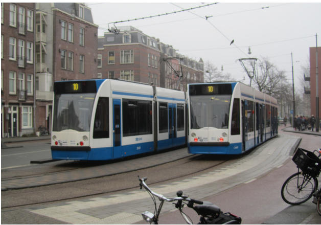
There is a regular tram service with a tram stop at the edge of the development site

Only one in six dwellings have a car parking space, but there is a car pool available which as a supply of electric cars. Housing blocks also have shared bicycles with baskets and trailers for loan. The site is well serviced by public transport, including a regular bus and tram service.