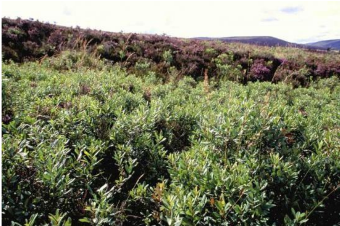
Image 1: Bog myrtle thicket, foreground. A sense of its conspicuousness where growing densely can be gleaned.

Map 1: Distribution of Myrica gale in 2000–9. The map suggests that, not surprisingly, it has been in retreat as major boglands have been drained. It is much more strikingly associated now with upland than with lowland bogs.