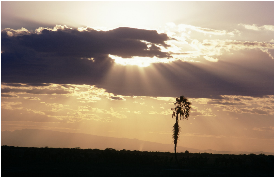
East Africa

For Soprano Soloist, SATB Choir and Chamber Orchestra