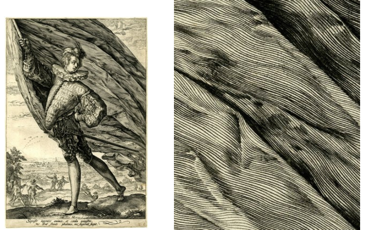
Figure 3: Hendrick Goltzius (1558–1617) The Standard Bearer (1587) Engraving. Right: detail of the folds of the flag. Reproduced with permission from The British Museum. Ref number 1853,1008.87AN49184001

The tradition of engraving and etching follows a particular syntax (Ivins, 1969) or language to describe the surface structure that ranges from equally spaced lines to describe smooth surfaces to thickening or diminishing of lines to suggest surface modulations. Halftoning is a well-known and used method of converting a grey scale image into a series of dots relative to the tonal values in the image, that when printed, creates the appearance of a continuous tone image. (Burch, 1983)