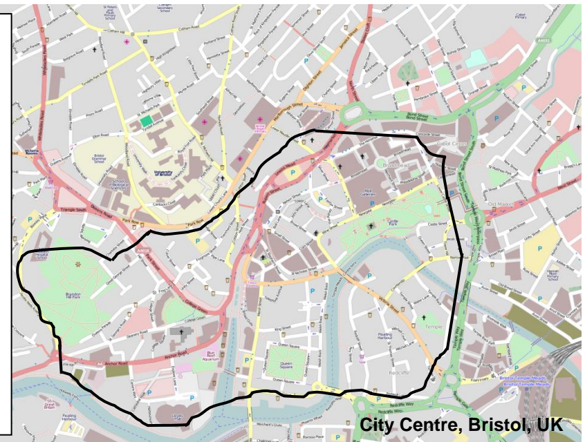
Figure 1: The hypothetical scheme

weekday road user charge of £4 operating strictly during morning-peak (7-10 hours am) collected automatically was assumed. Motorists would pay the toll only once per day if they crossed the black line or if they drove within the designated area. Public transport and emergency vehicles and all blue badge holders (i.e. severely disabled people with special permits) were excluded from paying while people living inside the charge area and low paid workers (statutory minimum wage) would pay a reduced charge.