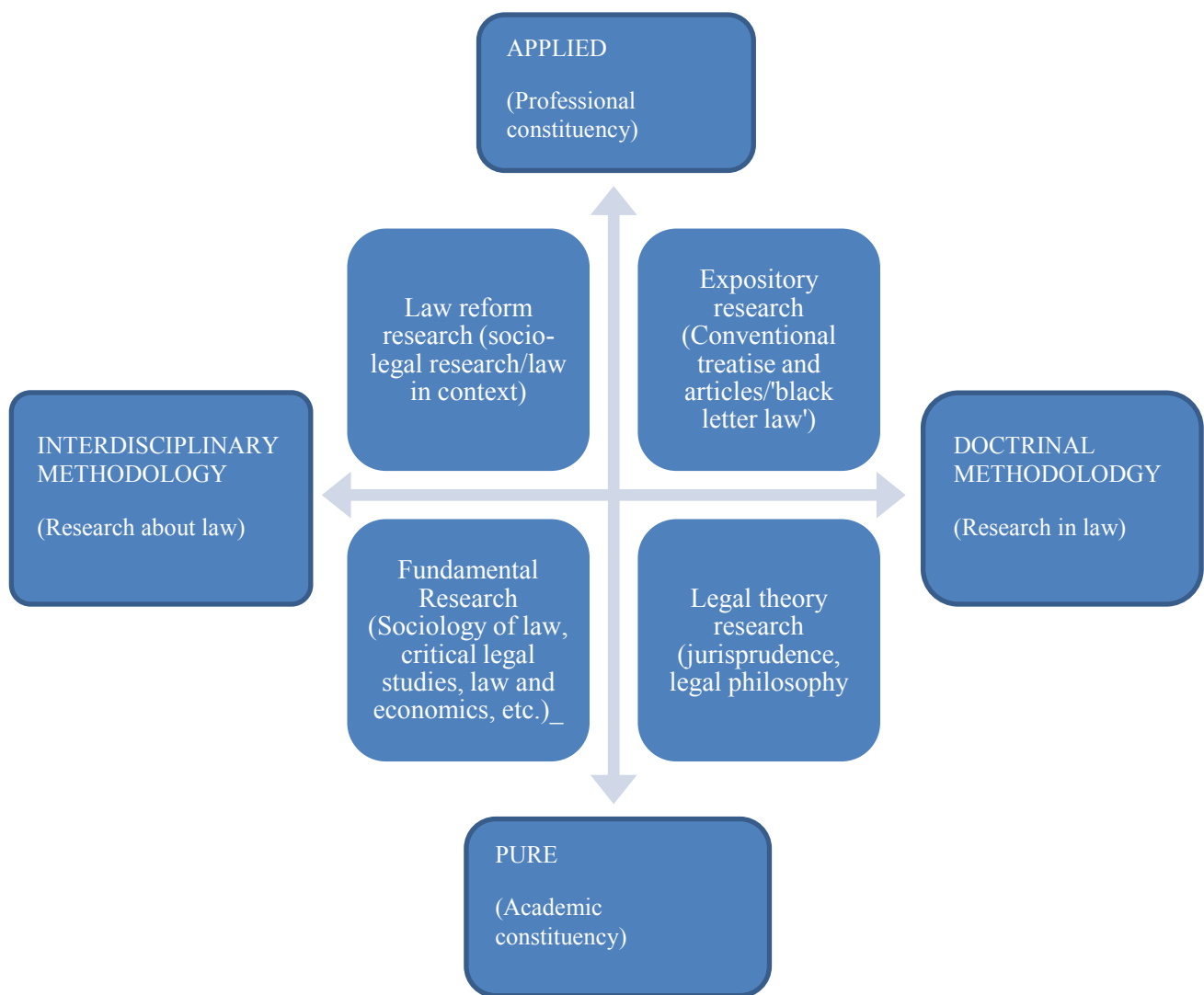
Fig. 1. Legal research styles (Arthurs, 1983)

In understanding OHH in a legal context 3 distinct (and contrasting) case studies have been used: