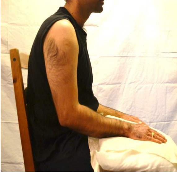
FIGURE 1: Patients' standardized position for Ultrasonographic measurements of AGT distance