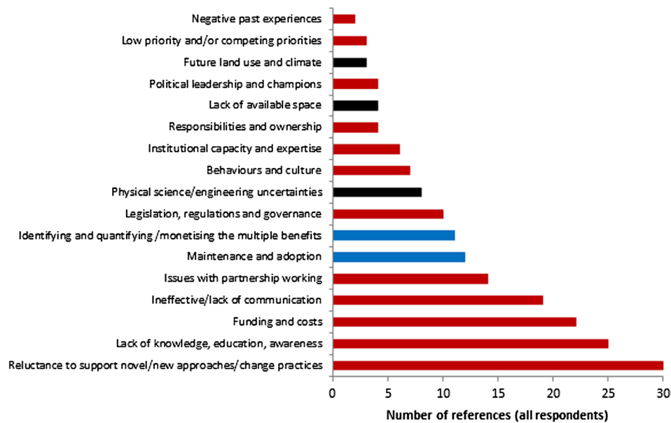
Figure 1. Barriers to the implementation of Blue-Green infrastructure in Newcastle. Red = socio-political barriers, black = biophysical barriers, blue = barriers that are both socio-political and biophysical.

qualitative research software (NVIVO 10). We used a Grounded Theory approach (Glaser and Strauss 1967) that allowed important issues to emerge directly from the data, reducing the impact of preconceptions. Sixteen nodes emerged through coding, summarising the raw data. We focused our analysis on two nodes related to barriers: 'Barriers to BGI' and 'Overcoming barriers'. The other nodes related to topics that are not discussed in this paper. The 'barrier nodes' were then separated into sub-nodes to further investigate and categorise challenges around implementation of BGI and how such issues could be overcome.