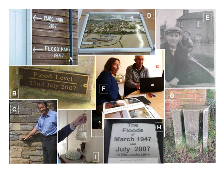
Figure 1 Forms of flood materialisation: collective and personal settings. A/B, epigraphic marking of varying persistence; C, remembering personal flood levels; D, July 2007 'a weekend in history'; E, historic 1947 flood photographs; F/H, sharing 'flood albums'; G, historic community protection measures; I, preserved flood water

Respondents across all Settings indicated that diverse methods of materialising and memorialising floods were used during and after the 2007 events to capture experiences, and to differentiate 'routine' from 'exceptional' flooding. Epigraphic marking of maximum 2007 levels, sometimes relative to historic 1947 floods, took place in private and public settings (e.g. a church (Setting 1), tea rooms (Setting 1) and garages (Settings 1, 2)) on individual or group initiative (Figure 1A-C). Flood materialisation also occurred through more traditional archiving - in personal, family and collective 'flood albums' (Settings 1, 4; Figure 1D-F), and through oral history and reminiscence storytelling (Setting 2).7 In one instance, a decanter of turbid 2007 floodwater was still on display in the home in 2014 - a materialisation and a memorialisation that produced 'disgust' (Figure 1I). Notably, increased use of communication technologies (social media; photo-sharing sites) expanded 'community' connections from local to regional and global (Garde-Hansen et al. 2016; Krause et al. 2012).