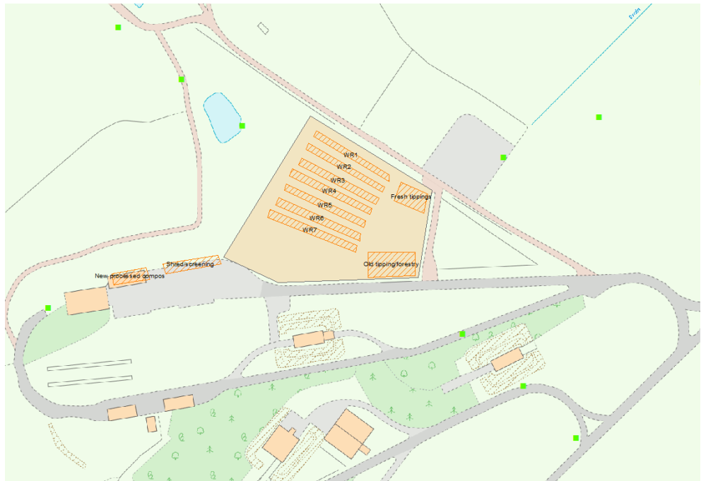
Figure 1: Site A layout.

account for the fact that each wind-row will be at a different maturation phase to the next and will be turned and screened at different times.