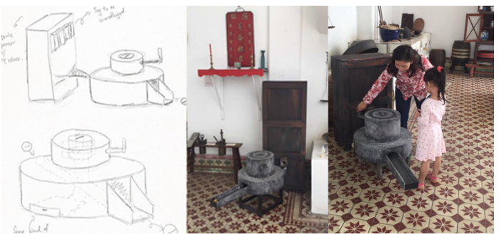
Figure 3: Batu Boh Design, Final Appearance and User Interaction