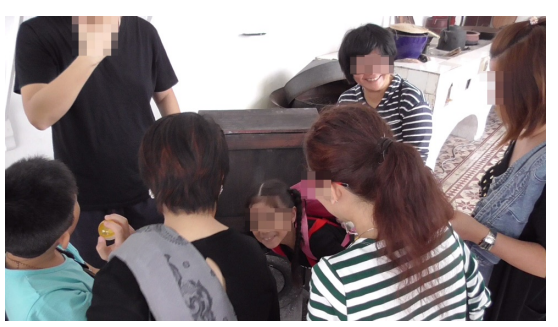
Figure 5: A group of users engaged in reflective discussion