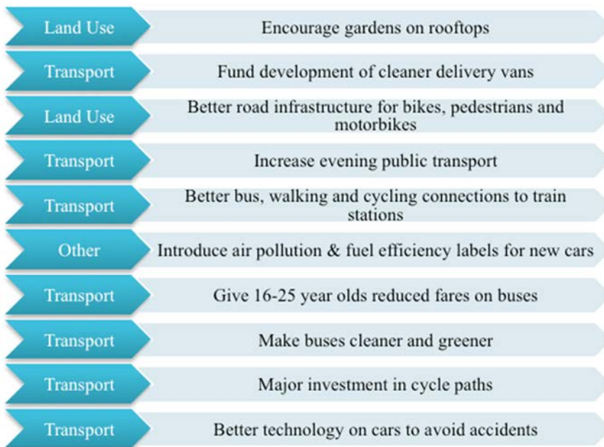
Figure 3: Example “Top 10” citizen policy choices from the Skyline Game in Bristol.