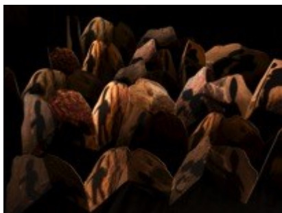
3) Latitude Travel diary in collaboration with Lina Meruane. UV printed folded book-work, published with Impact Press, Centre for Fine Print Research, UWE, Bristol, UK (2018)