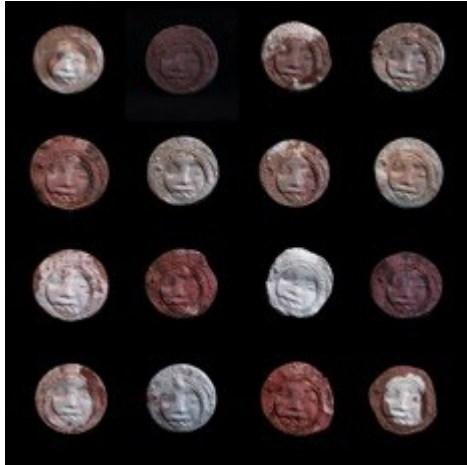
4) Stateless (Sorrow Portraits) Computer numerically control machined relief stamp, pressed into clay, in collaboration with Centre for Fine Print Research, UWE, Bristol, UK (2017)