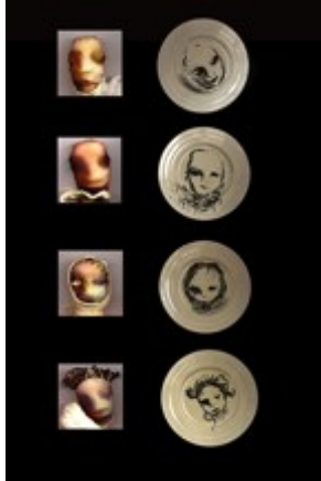
1) ID (Intensively Displaced) Inkjet print on paper (2003) Constelacion , Screenprint transfer prints on ceramic plates (2017)